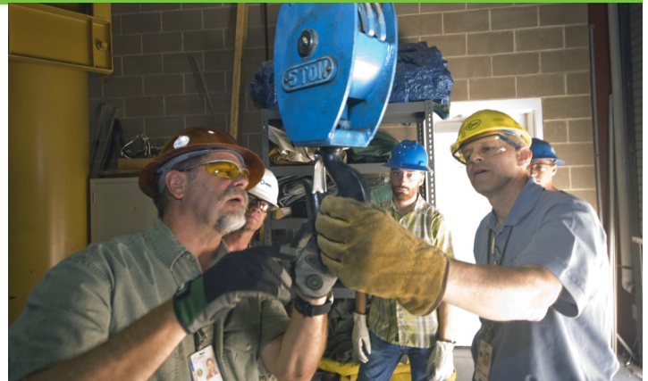
Get hands-on experience working at an Industrial Assessment Center.

The Office of Energy Efficiency and Renewable Energy (EERE) at the U.S. Department of Energy (DOE) has a number of resources available for graduate students, including research positions, internships, and career-planning information to help you navigate the education-to-employment pathway in energy. The following is a partial list of the graduate activities and programs that are offered. For a complete listing, visit our Energy Education and Workforce Development website: energy.gov/education