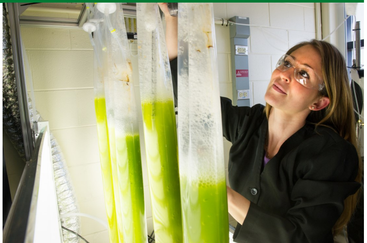
Contribute to technology research and development programs at national laboratories.