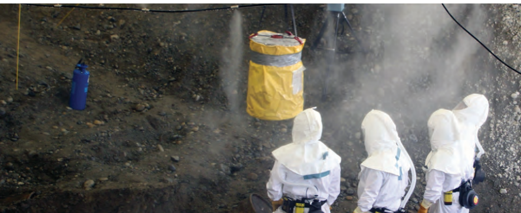
Department of Energy, Hanford Site - Richland