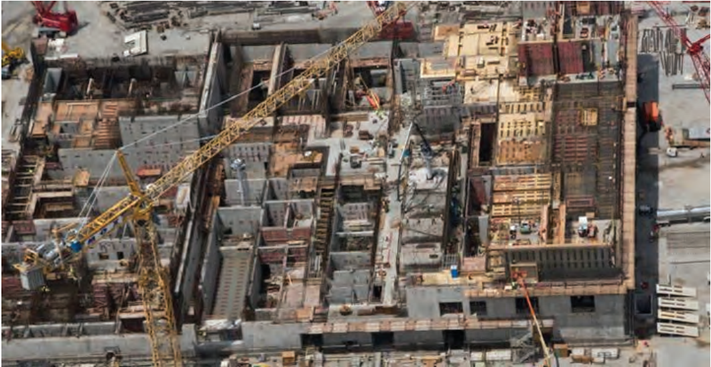
Department of Energy, Savannah River Site - Mixed Oxide Fuel Fabrication Facility Under Construction