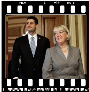
Dec 26 th : Bipartisan Budget Act of 2013 signed into law