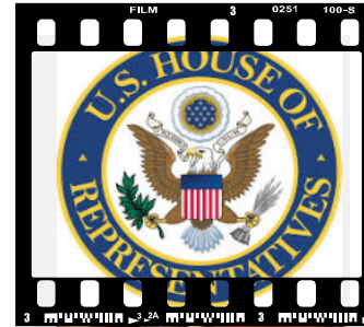
July 10 th : House passes FY 2015 mark, $5.632 B for EM, $10M above the request