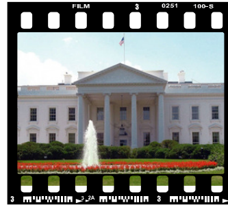
March 4 th : President releases FY 2015 budget request, $5.622 B for EM