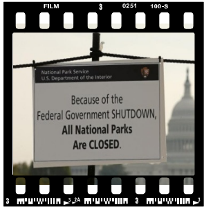
Oct. 1–16, 2013: Lapse in Appropriations