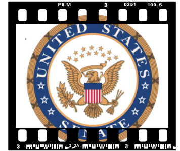
July 24 th : SEWD subcommittee FY 2015 mark, $5.942B for EM, $320M above the request