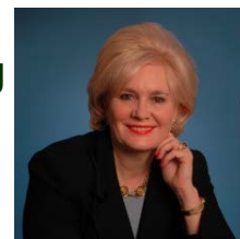
The Honorable Deborah L. Wince-Smith Council on Competitiveness

The United States faces today a distinctive moment in its history – a moment in which the nation can invest with the support of its energy strength and innovation capacity to unlock new competitiveness opportunities for the nation. With Accelerate Energy Productivity 2030 we continue and build on the success of the AEMC Partnership, propelling the United States to a position of global leadership in the decades to come.