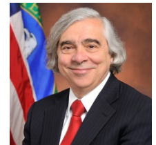
The Honorable Ernest J. Moniz Secretary of Energy

Taking action today to increase our energy productivity, by boosting the competitiveness of American manufacturers and building clean energy technologies here in the United States, will help grow our economy for generations to come.