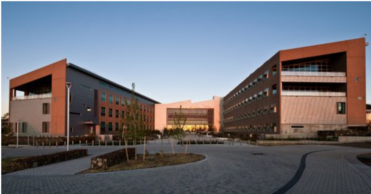
Figure 1. NREL's Research Support Facility Source: Dennis Schroeder (PIX17820)

The STM and NWTC sites are the two main sites where research operations are conducted and will be addressed separately in the discussion of environmental features. The DWOP is leased space used primarily for administrative functions and limited research activities. Similarly, Golden Hill is leased office space for administrative functions. The JSF is leased space currently used for storage. The ReFUEL facility is a leased facility that consists of a small shop complex housed within the RTD/DSOC facility. NREL performs engine-testing activities pertaining to fuels and lubricants at the site.