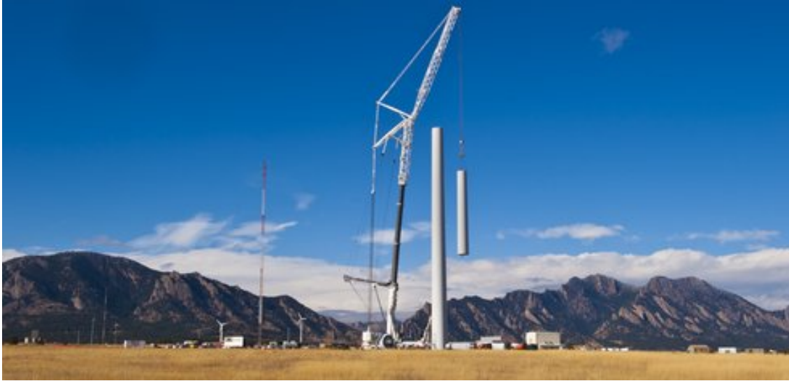
Figure 4. Turbine installation at the NWTC