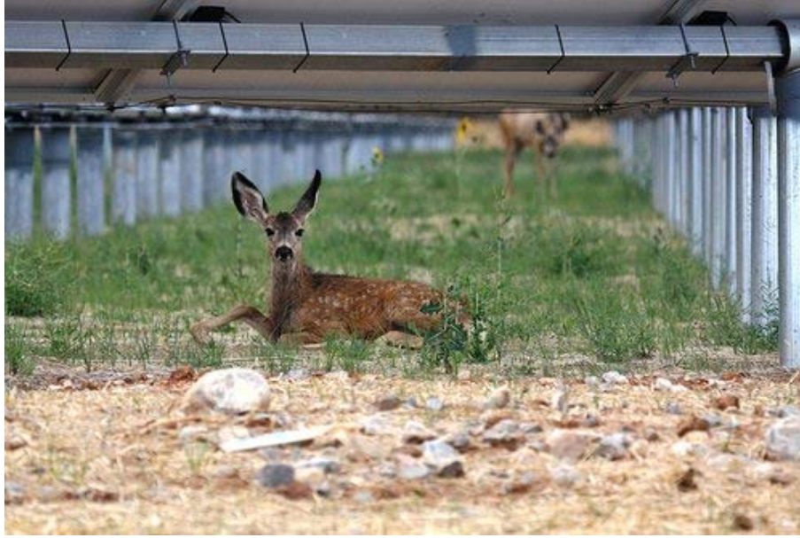
Figure 7. Mule deer and solar panels at NWTC