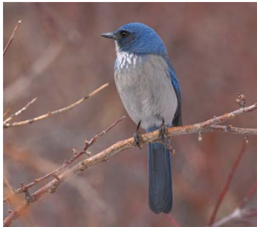
Figure 9. Scrub-jay often found at STM

The survey included large and small mammals, predators, migratory birds and raptors, upland game birds, and invertebrates identified on an opportunistic basis (i.e., only as they are found during other surveys). A list of species observed at NREL is found in Appendix B; it includes the species observed during the year-long STM wildlife survey.