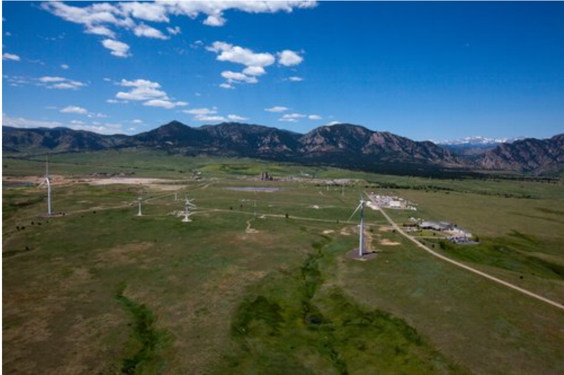
Figure 3. NWTC aerial view