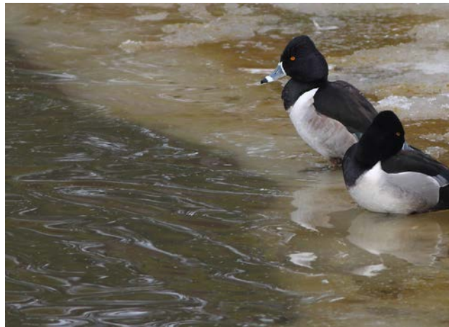
Figure 10. Ring-necked ducks found in winter at DWOP

Planning activities for 2011 primarily involve the continuation and completion of the wildlife survey activities and the avian monitoring work. Bird and bat mortality surveys and the breeding bird transects will also be completed in 2011. The final reports for these efforts will be generated, reviewed, and finalized in 2011. The need for ground-nesting bird surveys is anticipated. NREL is also planning to install bat acoustic monitoring stations to continue data collection on bat presence and abundance.