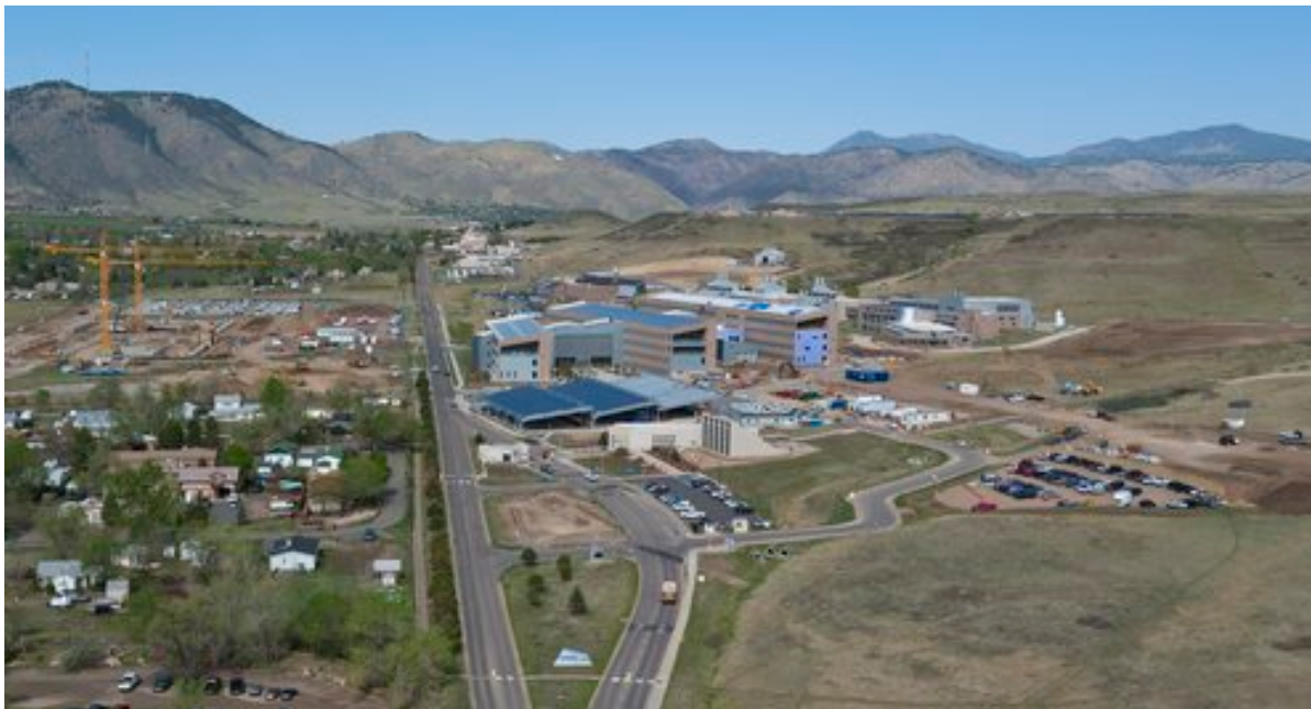
Figure 2. NREL's STM campus

claystone, sandstone, and conglomerate. Sedimentary rocks of the Arapahoe Formation underlie the Denver Formation.