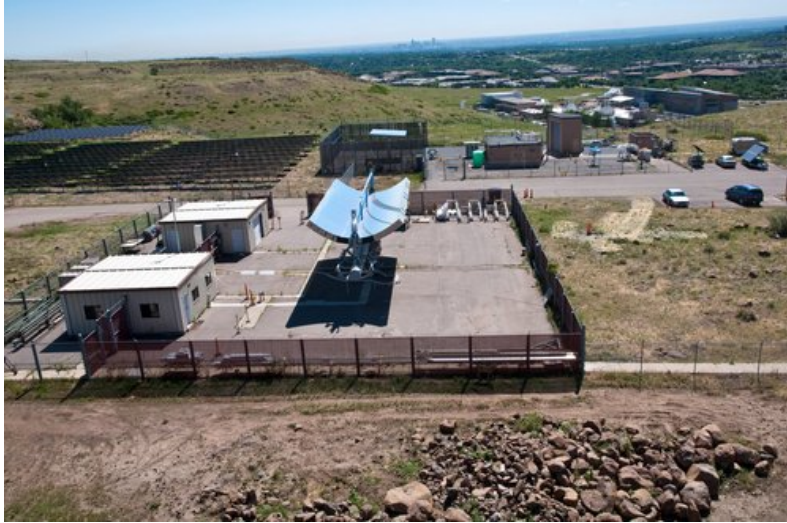
Figure 5. Concentrating solar power research lab on STM