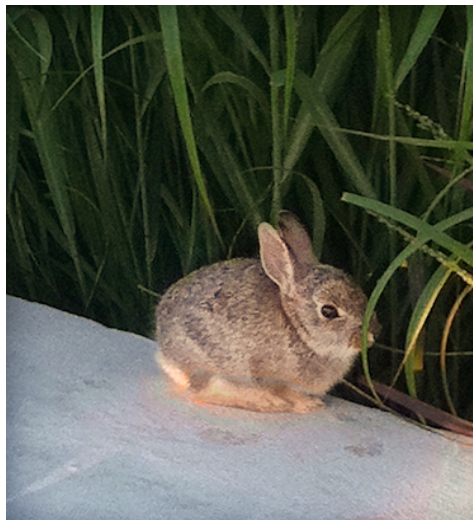
Figure 8. Young rabbit at RSF

Similar to the NWTC, the STM site is located in the transition zone between the Great Plains and the Rocky Mountains, resulting in habitat that contains elements from both mountain and prairie ecosystems. Wildlife habitat at the STM site is primarily grasslands and shrublands, which supports a variety of wildlife species including birds, mammals, reptiles, and amphibians. The variety of vegetation types attracts species that may use the site as year-round habitat, for breeding only, during migration, or as winter habitat.