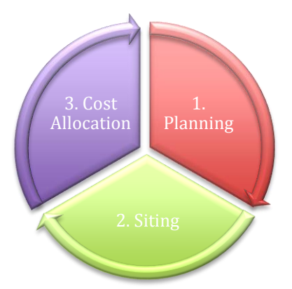
Figure 4. Planning, siting, and cost allocation are steps in building new transmission.

Planning, siting, and cost allocation (see Figure 4) are the three major regulatory elements of building new transmission. Transmission projects can take more than a decade to reach operation. But once built, they can provide a steady and reliable return on equity for decades. A number of cost-recovery schemes are available, but the incentive to build transmission rests on the fact that, relative to many other