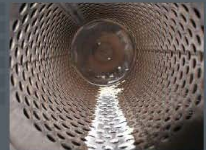
Airless Benchmark System