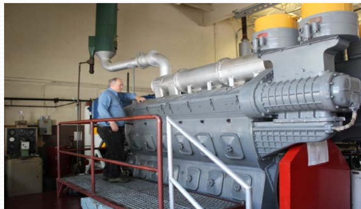
Ships and Engines at Maine Maritime Academy