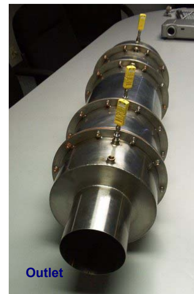
AirFlow Test Can