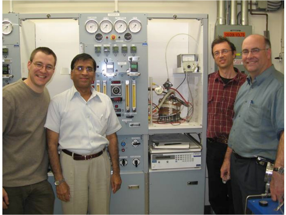
FuelCell Energy team members showcase their electrochemical hydrogen compressor.

Hydrogen compression has emerged as a key technical challenge in developing