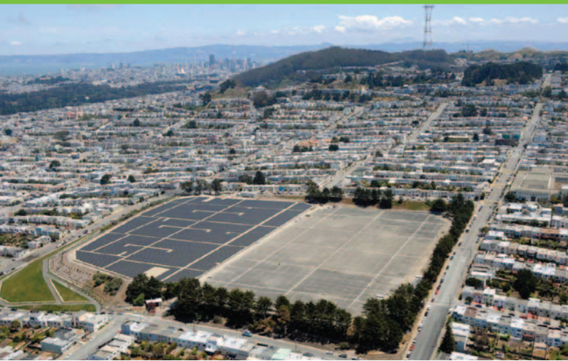
The Sunset Reservoir's 5-MW PV system, financed through a Power Purchase Agreement, significantly boosted solar generation in San Francisco.