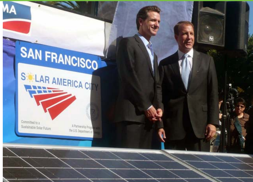
Then-Mayor Gavin Newsom and John Lushetsky, DOE's Solar Energy Technologies program manager, celebrate San Francisco's designation as a Solar America City.

Between October 2008 and May 2009, more than 100 building owners responded with requests for assessments. Site assessors visited these properties to gather more detailed information. They then analyzed the available roof area and solar exposure, and estimated the potential size, energy production, cost, and payback for a solar system on each building. This information helped building owners decide whether to move forward with a solar energy system.