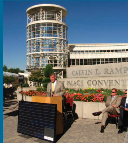
Clockwise from top left: Photovoltaic system in Philadelphia Center City district; rooftop solar electric system at sunset; Premier Homes development with building-integrated PV roofing, near Sacramento; PV on Calvin L. Rampton Salt Palace Convention Center in Salt Lake City; PV on the Denver Museum of Nature and Science; and solar parking structure system at the Cal Expo in Sacramento, California