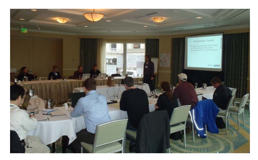
Figure 1. Photo taken during Expert Meeting