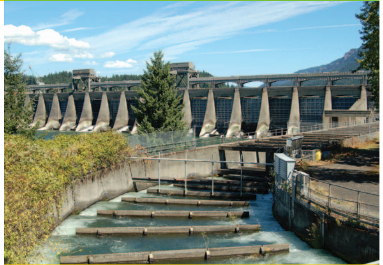
The Bonneville Dam on the Columbia River between Washington and Oregon provides safe passage to migratory fish via its fish ladders while maintaining a capacity rating of more than 1,000 megawatts.

Since the 1880s conventional hydropower has generated electricity. During the 1940s, it provided more than one-third of the nation's electricity. Although non-federal entities own the majority of the nation's individual hydropower plants, about half of the nation's hydroelectric generation capacity is owned and operated by federal agencies, most notably the U.S. Army Corps of Engineers and the Department of the Interior's Bureau of Reclamation. DOE works with these