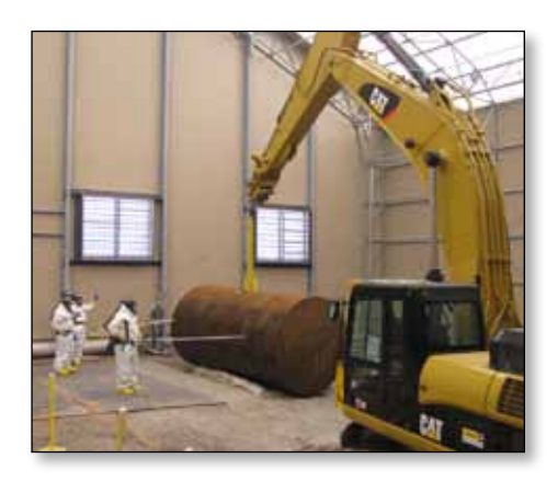
Workers practice tank removal inside the Tank W-1A enclosure.

Darby said about 355 cubic yards will be excavated. The resulting hole will be back-filled with an impermeable grout. "It will prevent recontamination of the limited tank area," said Darby. "Contamination from adjacent areas will not re-contaminate the excavated area." The area is under an enclosure to prevent rain from getting in the hole and allow all-weather activities.