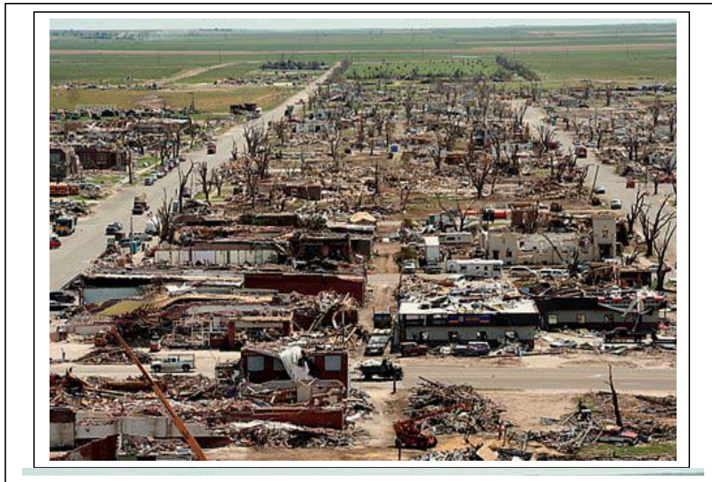
NREL PIX #16290