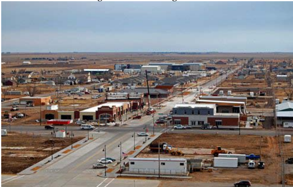
Figure 3. Greensburg Three Years Later