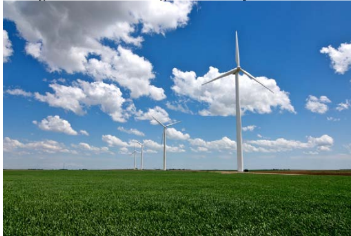
Figure 4. Greensburg Community Wind Farm