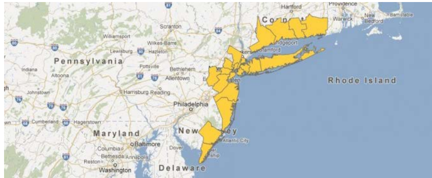
Figure 2. 7 FEMA Disaster Areas

Some commercial and industrial facilities in the area were able to power through Superstorm Sandy due to CHP. This report summarizes how CI facilities with CHP systems operated during this storm. Several examples from other storms and blackout events in other regions of the country are also included. This report also provides information on the use of CHP for reliability purposes, as well as state and local policies designed to promote CHP in CI applications.