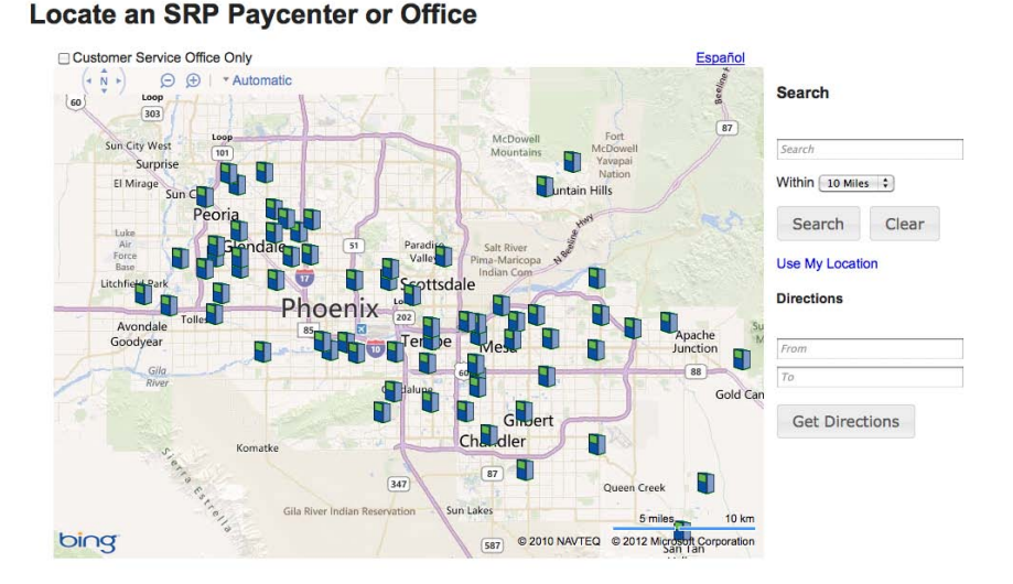
Figure 2: An interactive map helps consumers find payment locations

A special meter is installed at the home and the resident receives an in-home display unit that can read the smart card and monitor energy costs, usage data, and the balance remaining on the account. It also gives an estimate of the days remaining based on the current usage pattern.