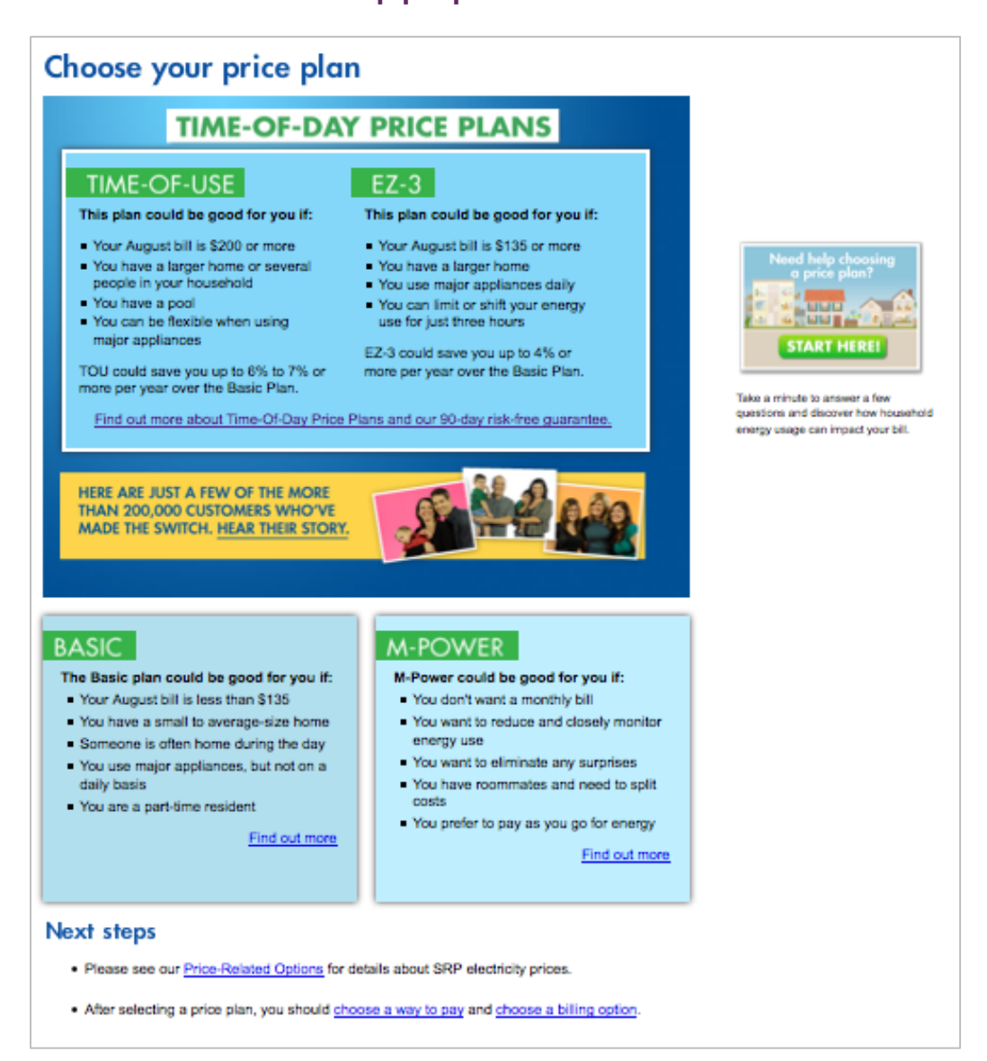
Figure 3: The various plans are presented as options featuring factors that help people self-select<sup>5</sup>

customers had what they needed." Figures 3 and 4 present an SRP price plan example and screen shots from the interactive online application, respectively.