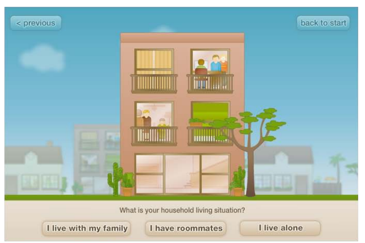
Figure 4: SRP has put tools in place to measure people visiting the interactive application. As of March 2012, it was averaging about 3,300 unique customer visits a month. Feedback has been very positive.