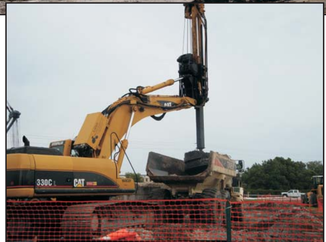
Placing soil from the large-diameter auger into a dump truck at the 4.5 Acre Site.

determined that the most efficient and cost-effective contaminant source removal option was soil excavation using a large-diameter auger. To remove the material with an auger, circular steel casing was placed in the ground at a depth of approximately 30 feet below land surface. Then the auger was placed inside the casing and the soil was drilled out. The soil was removed in lifts and spun off the auger into a dump truck.