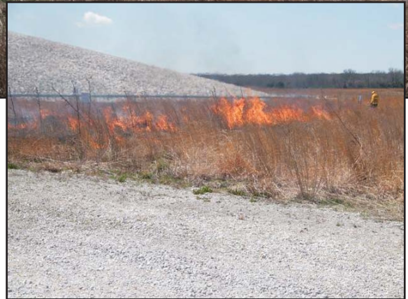
An on-site gravel road is an ideal burn break. The Weldon Spring disposal cell is in the background.

widespread burning in the spring of 2009. The site was segregated into individual burn management units based on land grade and existing burn breaks, such as roadways. To safely and effectively conduct this work, weather conditions within specific parameters needed to be in place. On April 6, the ideal wind direction, wind speed, air temperature, and relative humidity allowed burning activities to commence. Rain in the afternoon of April 8 ended activities. Approximately 75 acres of the burn management units were burned using industry-accepted methods. All activities were conducted safely and without incident.