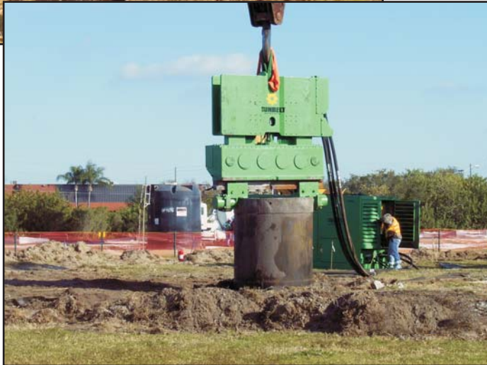
Top photo: Removing soil with a large-diameter auger at the Northeast Site.

“We’re hoping to see a significant reduction in chemical concentrations in the next few years,” said Craig. “The sites are expected to be available for commercial development and use soon.”