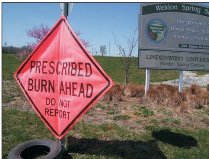
Signs placed near roadways alert the public to burning activities.

Spring rains facilitated rapid greening of the blackened ground and by early May the charred areas were no longer visible. Prescribed burning provides many environmental benefits to the prairie including suppression of annual weeds, invasive exotic species, and woody plants. Burning those plants introduces nutrients into the soil and stimulates the growth of many native species.