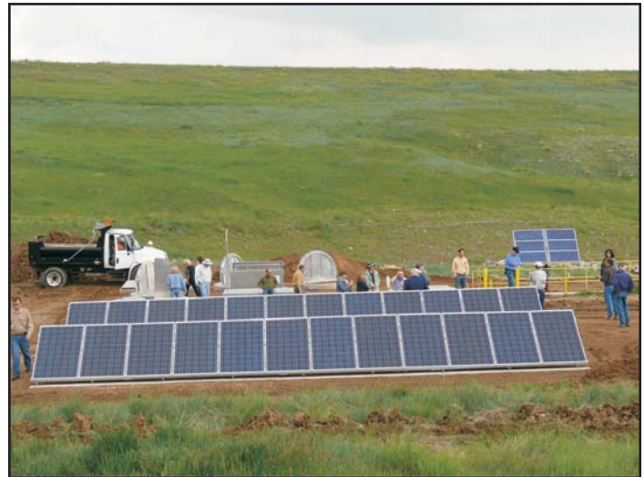
Members of the Rocky Flats Stewardship Council, the Local Stakeholders Organization or LSO, for Rocky Flats tour the recently completed Phase II and III upgrades to the Solar Ponds Plume Treatment System. The large solar array in the foreground is rated at approximately 5 kilowatts, enough to power all of the pumps, automated monitoring devices, and telemetry equipment associated with the system.

The fundamental principles used by the Phase II uranium removal cell and the Phase III nitrate removal cells are time-tested. However, creative engineering and operational measures had to be devised to meet the challenges presented at Rocky Flats.