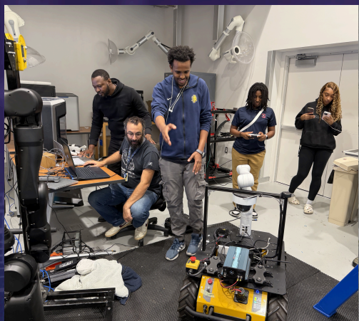
North Carolina A&T State University