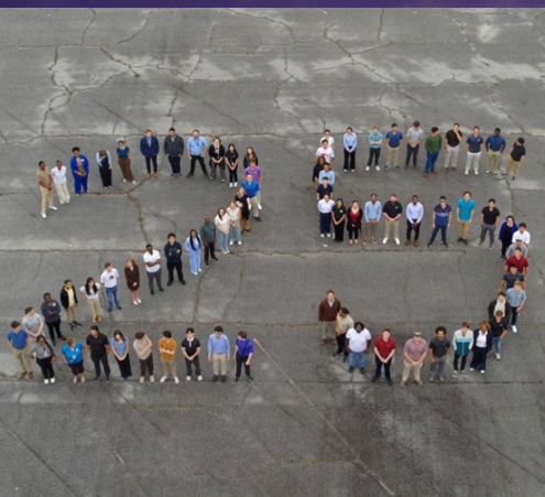
Savannah River National Laboratory