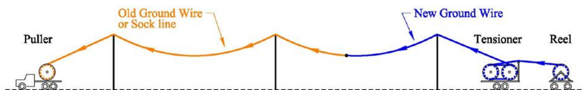
Figure 3. Typical Stringing Operation

Helicopter flight paths would follow BPA's right-of-way when in close proximity to the project corridor. If needed, an FAA congested area plan including the use of flaggers would be required where the line crosses these highways in Oregon: Highway 197 in The Dalles, Highway 35 in Parkdale and Highway 26 in Sandy. Once removed, the old conductors would be delivered to a metal salvage location and recycled.