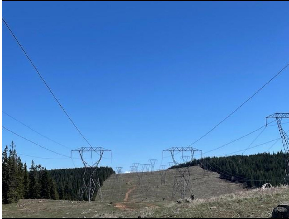
Figure 2. Big Eddy-Ostrander Right-of-Way

Note: The transmission lines pictured from left to right are Big Eddy-Troutdale No. 1, Big Eddy-Chemewa No. 1, Big Eddy-McLoughlin No. 1, and Big Eddy-Ostrander No. 1.