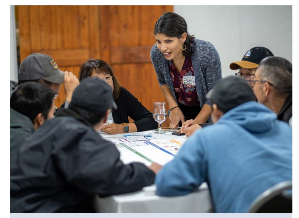
C-MAP participants will define microgrid projects based on local resources, needs, and opportunities.

For more information about C-MAP or to join the technical assistance partnership, contact cmap@nrel.gov or visit our website: www.energy.gov/c-map .