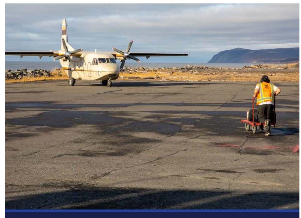
Advanced microgrids can stabilize and lower energy costs in areas with long and precarious supply chains. Photo of Unalakleet, Alaska, by the National Renewable Energy Laboratory.

The Microgrid Innovation Network brings together individuals and organizations to exchange, compile, and disseminate knowledge relevant to or generated by C-MAP. Any communities interested in microgrids, vendors, energy providers, researchers, and government officials are encouraged to participate.