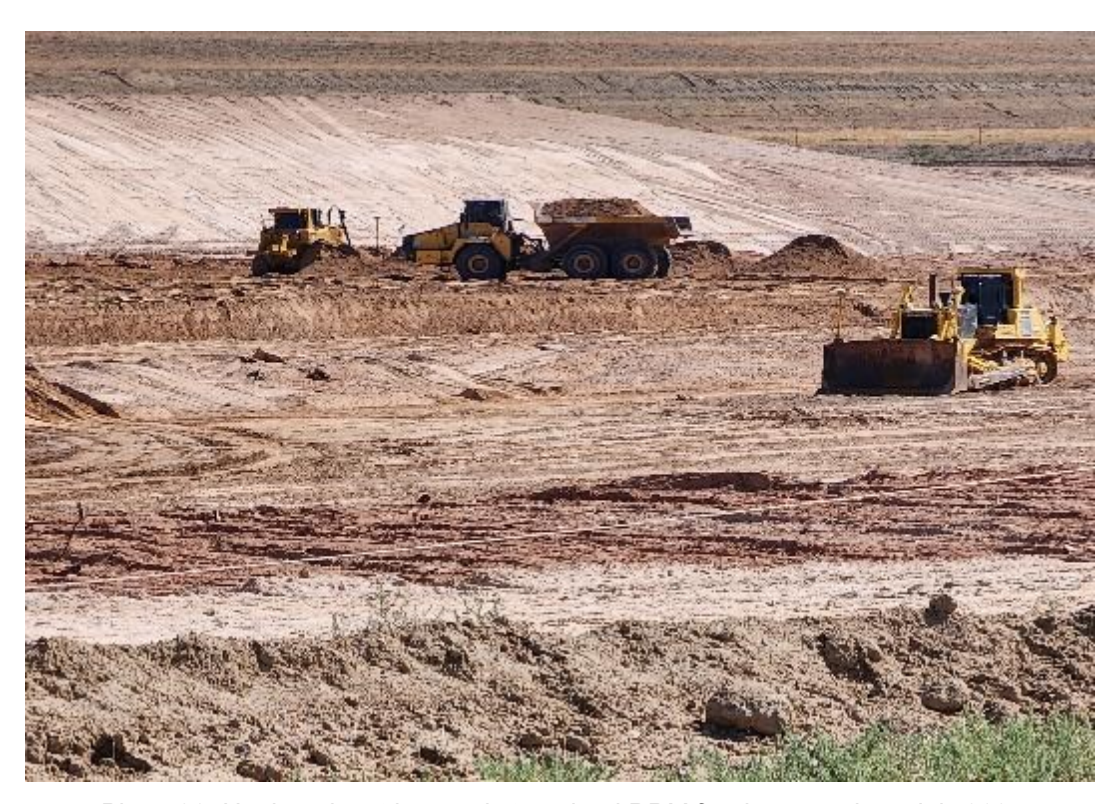
Photo 20. Haul truck getting ready to unload RRM for dozer to place July 2024