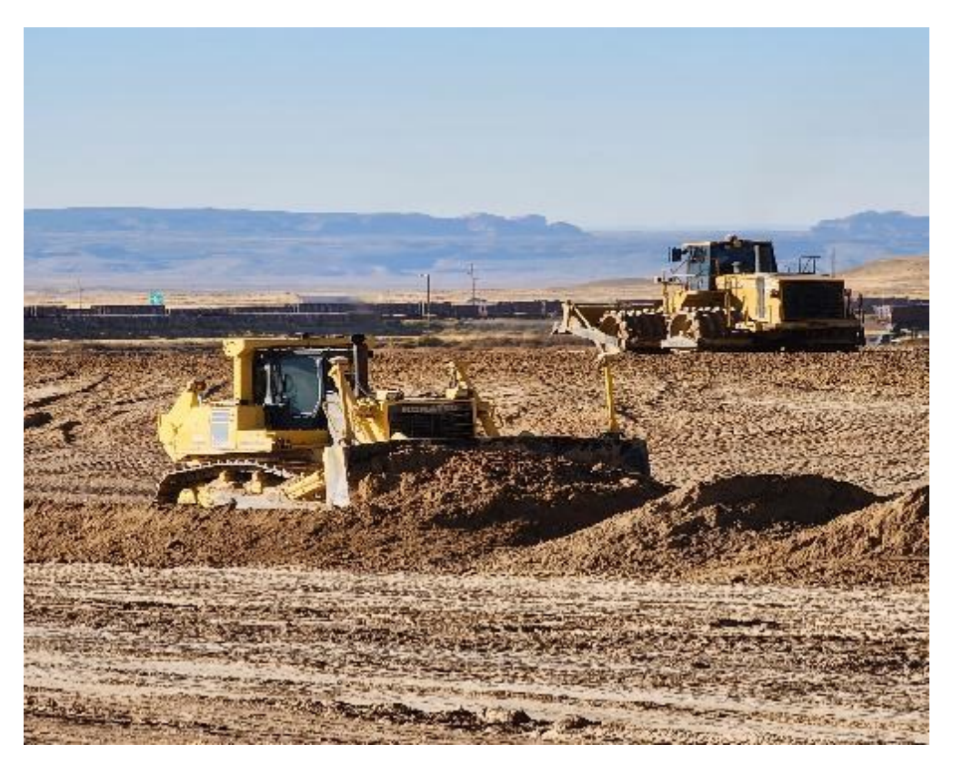
Photo 1. Dozer placing RRM and compactor compacting on lift above October 2023