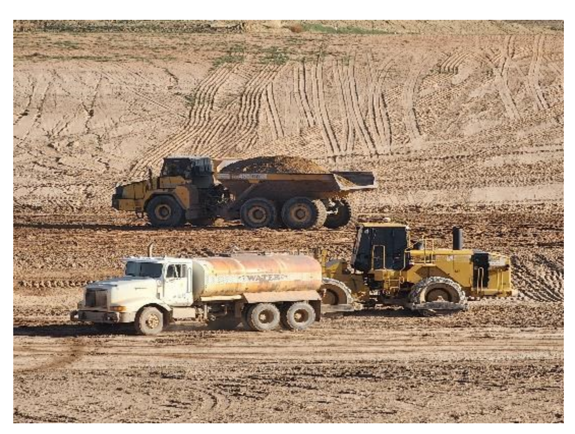
Photo 18. Compactor, water truck, and haul truck working together June 2024