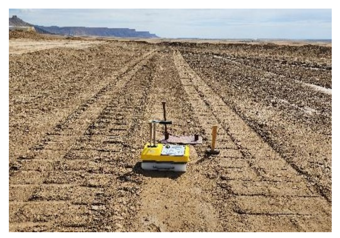
Photo 27. QC performing moisture/density test on Interim Cover July 2024