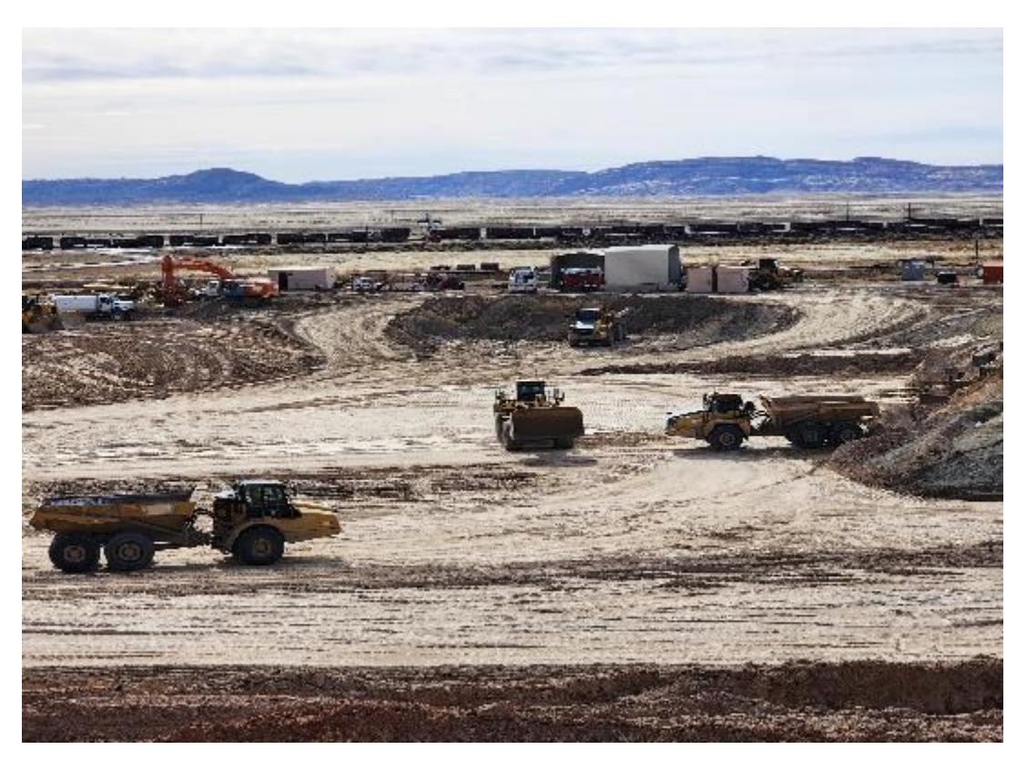
Photo 9. Loader and haul trucks waiting for containers of RRM February 2024