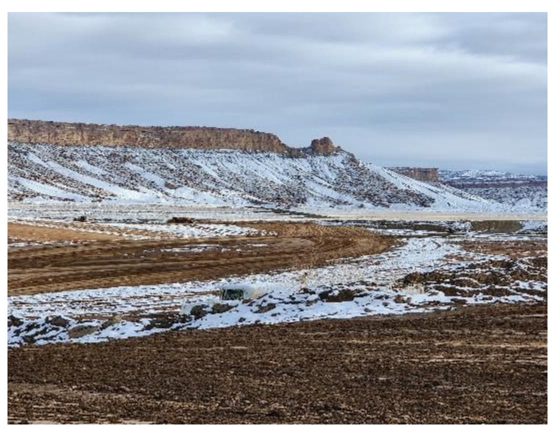
Photo 12. Dozer cleaning snow off lifts before placement March 2024