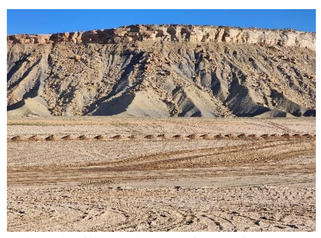
Photo 24. Piles of RRM mixed with debris staged for placement September 2024