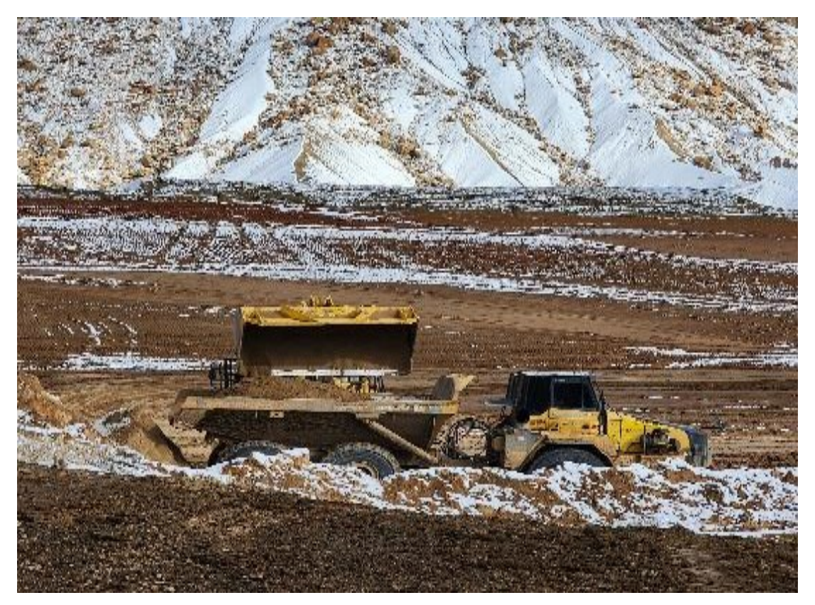
Photo 10. Loading RRM with a little snow still in the ground February 2024