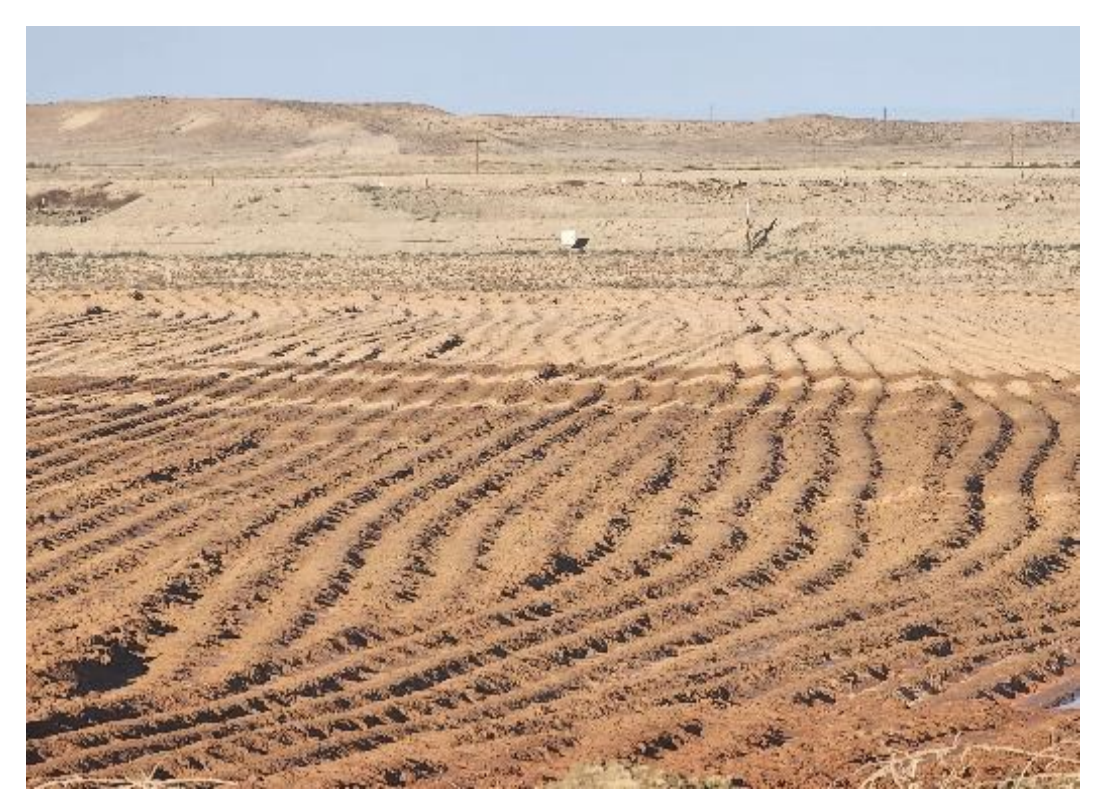
Photo 25. Scarified TOW prepped for Interim Cover placement July 2024