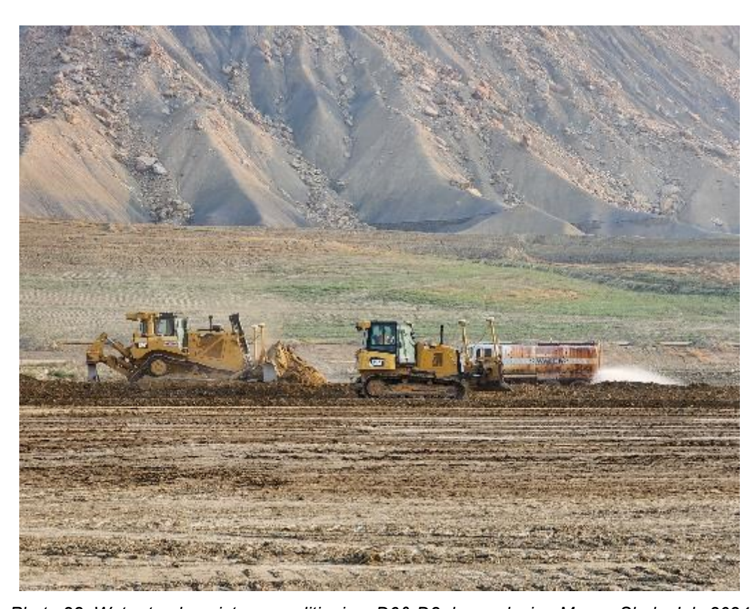
Photo 28. Water truck moisture conditioning; D6& D8 dozer placing Manco Shale July 2024