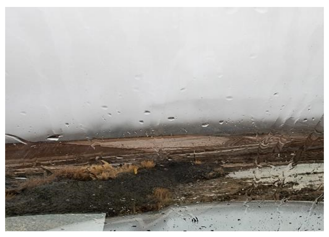
Photo 66. Due to rain, mud, and snow it was unsafe to haul to Spoils Embankment. April 2023