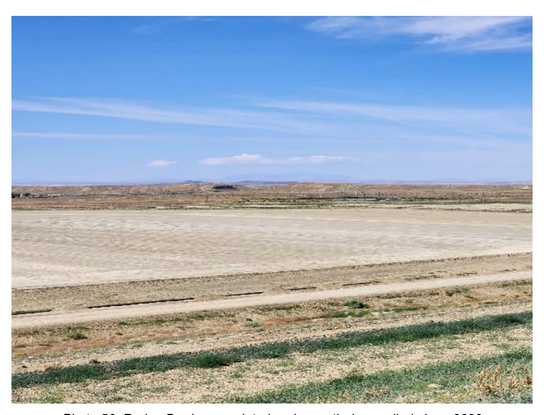
Photo 56. Radon Barrier completed and smooth drum rolled. June 2023