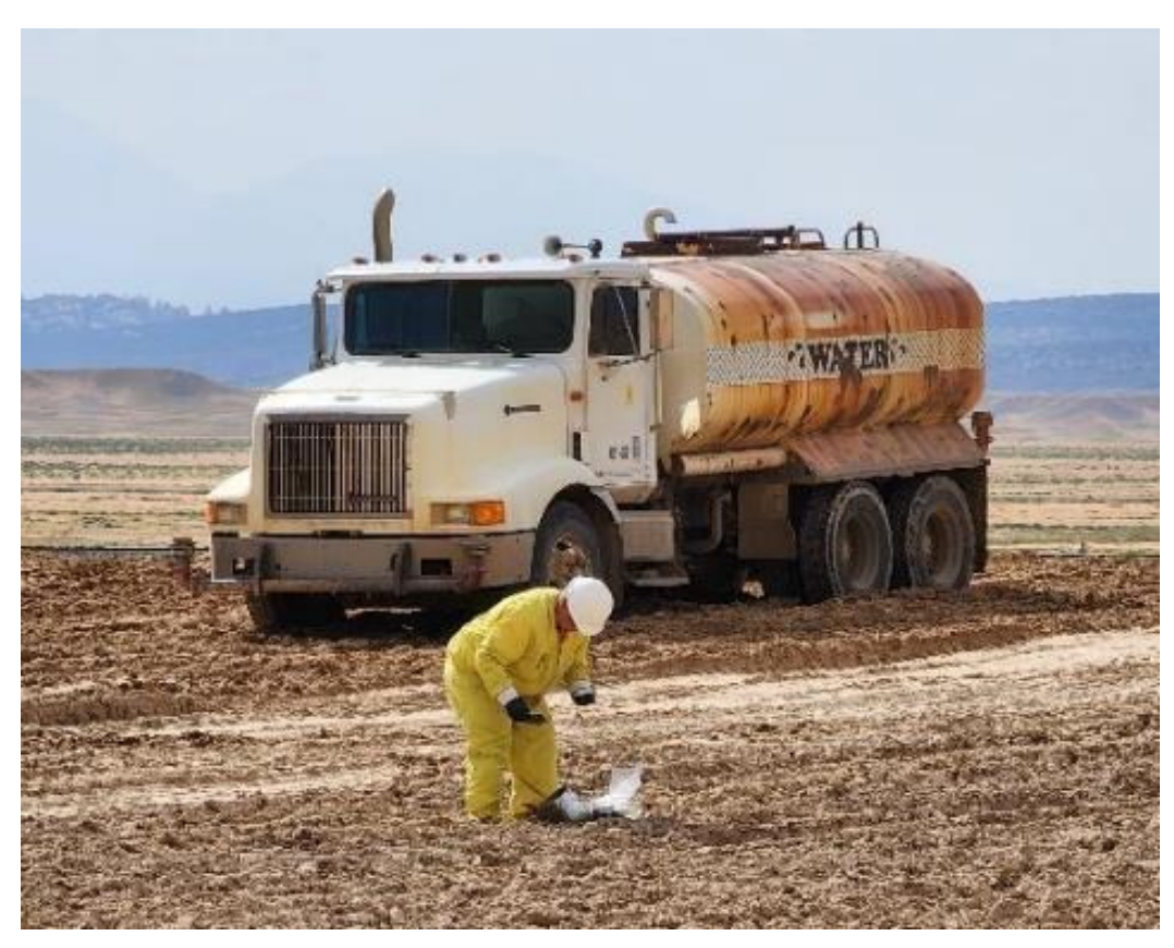
Photo 34. Radiological Control personnel collecting 707 pCi/g samples. August 2023