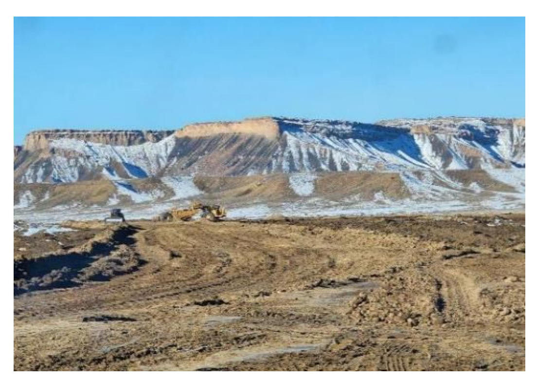
Photo 61. Scraper and dozer working on Spoils Embankment January 2023