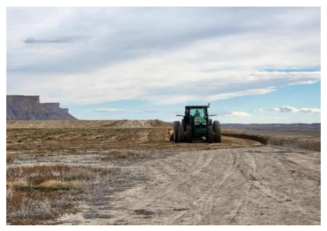
Photo 57. Ames removing vegetation on Spoils Embankment. November 2022