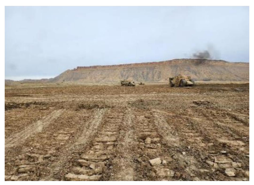
Photo 44. Ames placing Mancos Shale on Radon Barrier lift. December 2022