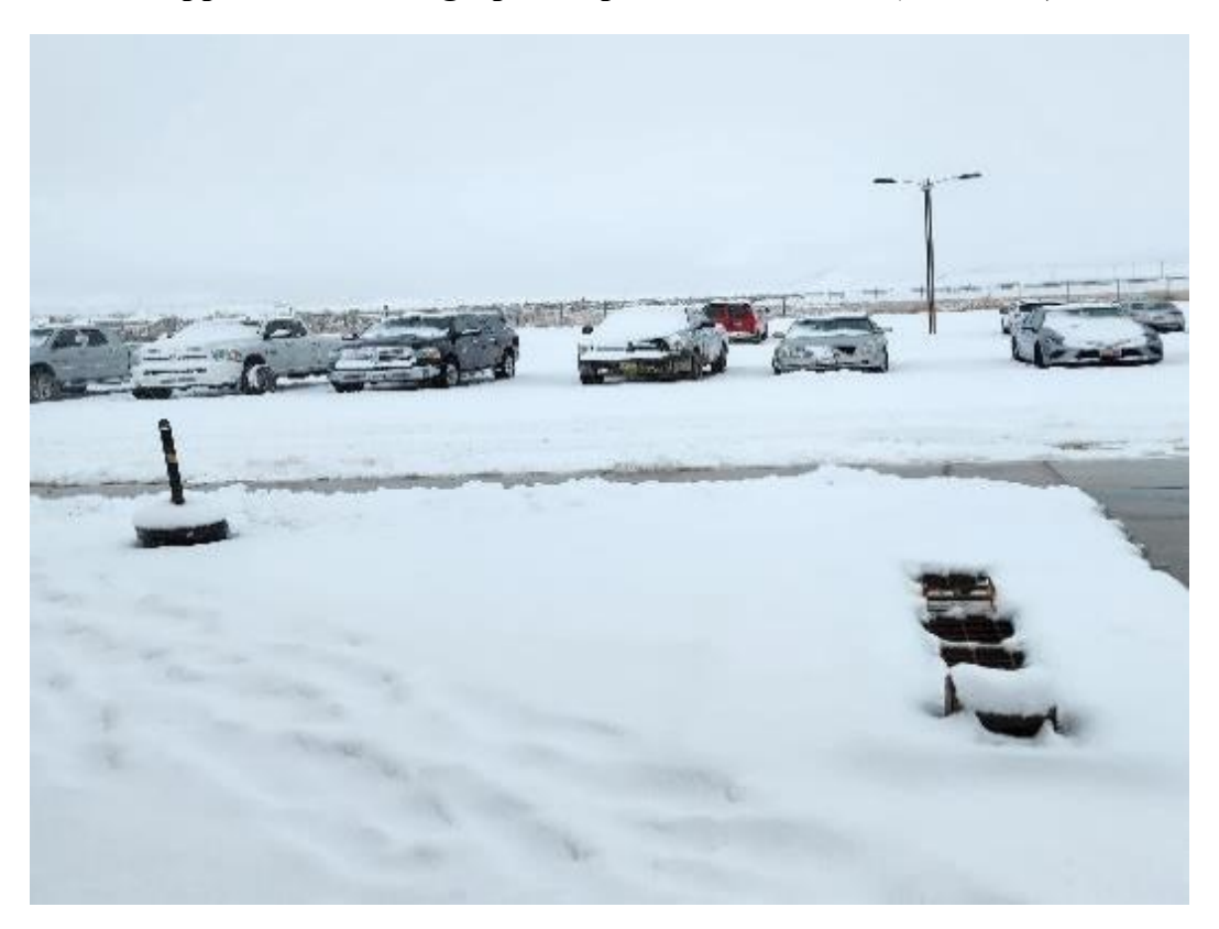
Photo 65. Due to weather conditions Ames called off work. March 2023