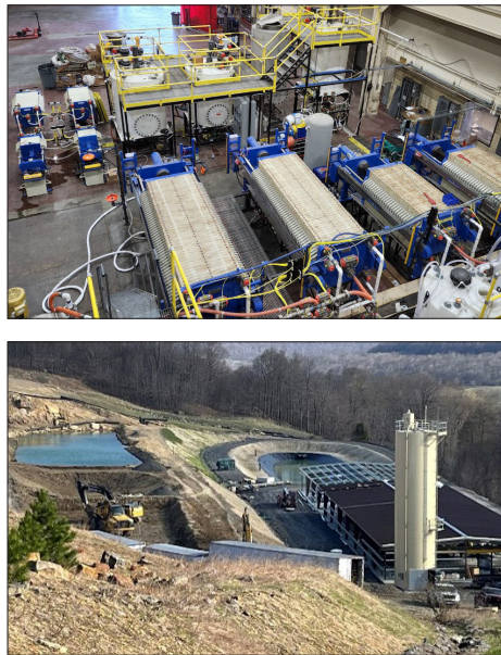
Figure 2. Small pilot facilities for processing rare earth elements from coal-based resources. Clockwise from top left lead performer and feedstock (University of North Dakota, lignite; Winner Water Services, coal ash; University of Kentucky, coal refuse and lignite; West Virginia University, acid mine drainage

These projects create opportunities for the United States to bring manufacturing back to the country and expand crucial energy jobs. By remediating existing sites and plugging into existing