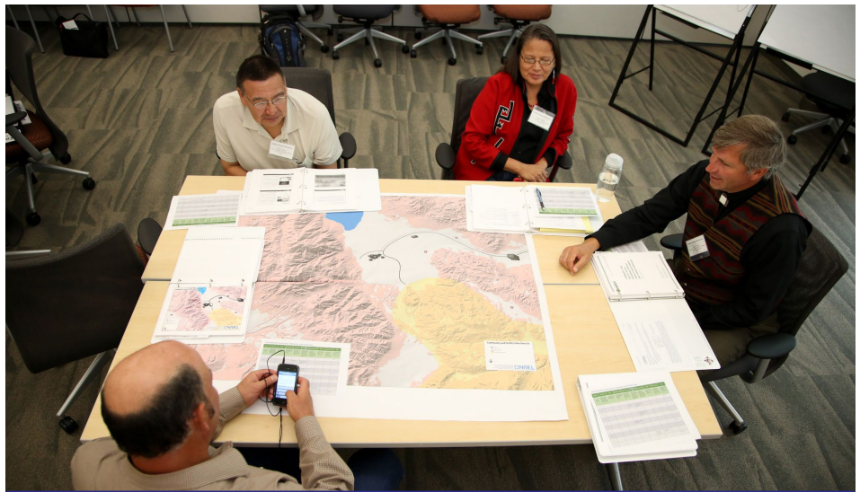
Tribal representatives at a planning session.

The U.S. Department of Energy (DOE) Office of Indian Energy offers six types of no-cost technical assistance to federally recognized Indian Tribes and Tribal entities, including Alaska Native regional and Village corporations, to support the advancement of energy projects.