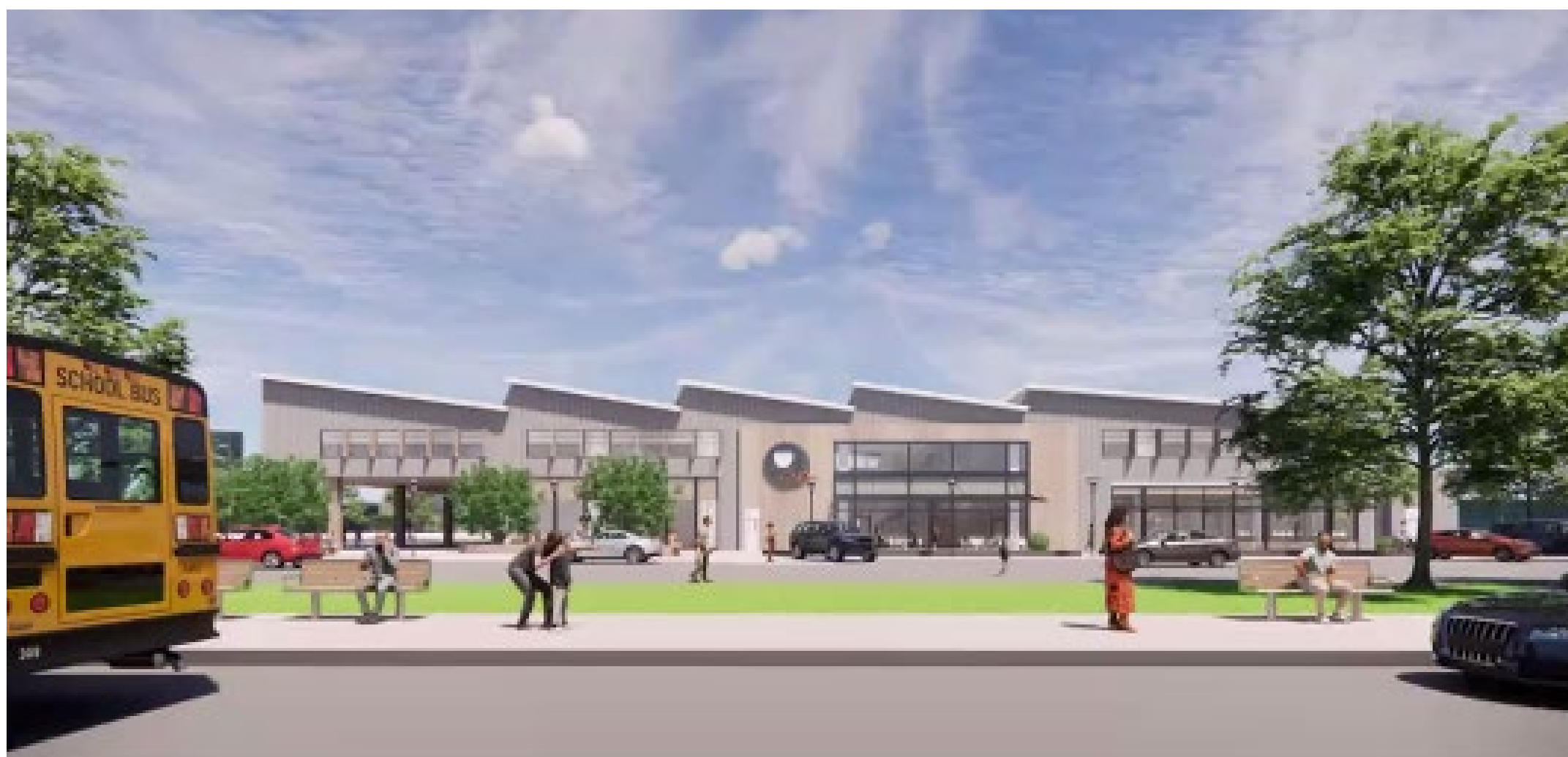
Rendering by Illinois Institute of Technology Design Challenge team, a ZEDD-recognized program.