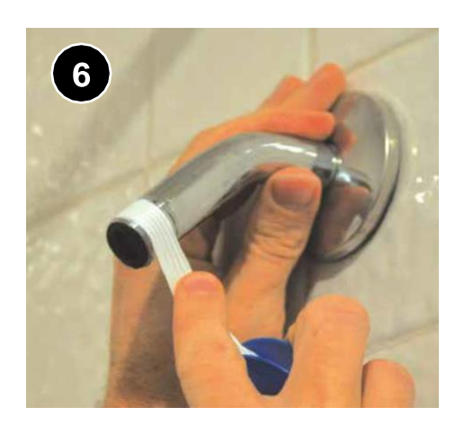
Wrap new thread tape around threads. 7.0201.1c