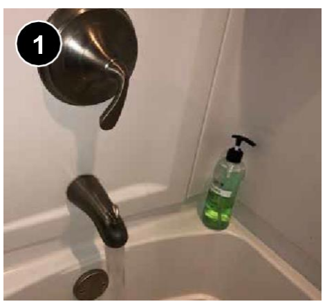
Verify current plumbing infrastructure is sufficient to support the installation(s) and water is free of visible debris that may clog the equipment. 7.0201.1a.