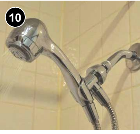
Verify proper water flow and that there are no leaks.