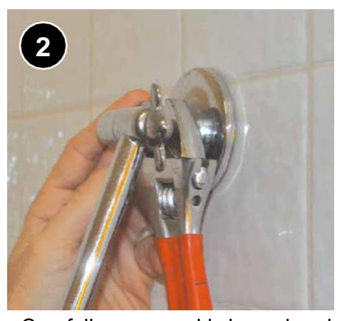
Carefully remove old showerhead with adjustable wrench, taking care not to loosen shower arm.