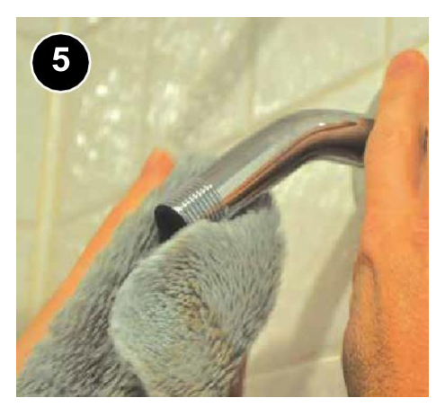
Clean threads of shower arm well to remove old residue.