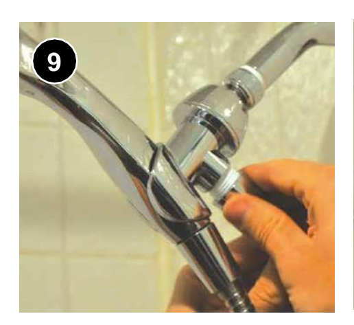
Use thread tape at all connections.