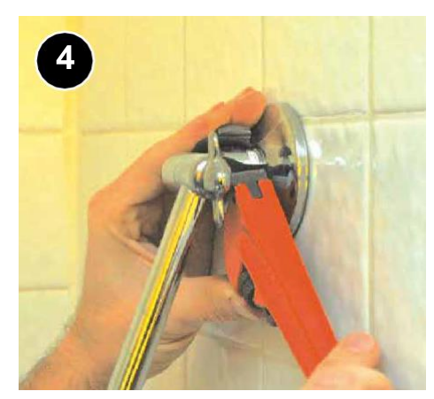
Then use pipe wrench or channel locks to loosen connection at shower arm.