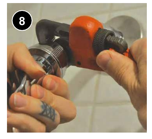
Ensure that connections will not leak while preventing damage by using buffer material.