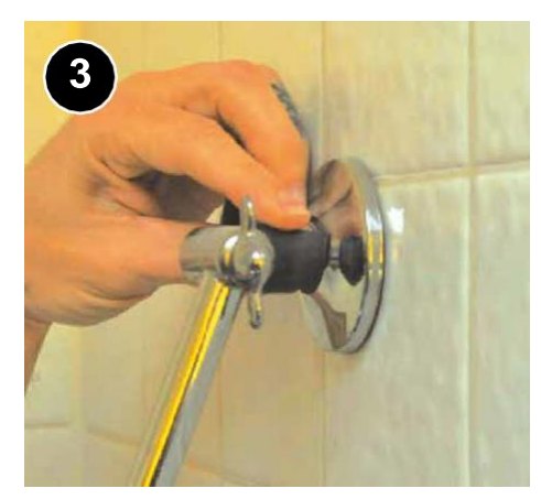
If old showerhead does not have flat sides at connection, wrap with buffer material, such as a piece of rubber.