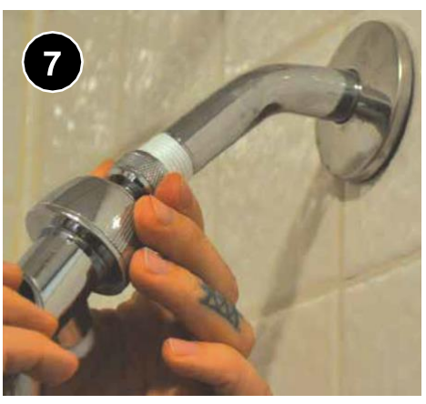
Install new showerhead according to occupant needs, such as handheld, shut-off, or swivel.