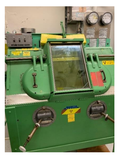
FIGURE 2: SHIELDED GLOVE BOX

During a routine survey in December 2021, an RCT identified a possible radiation area when the sleeve ports of a shielded glovebox were left open and radiation levels measured above 5 mrem at the sleeve port. An RCT expressed concerns about workers' whole body exposure and proper glovebox monitoring. The concerns raised by the RCT resulted in a critique held by RPG officials in January 2022; however, the critique did not address the RCT's concerns about radiation exposure and glovebox monitoring. Instead, the critique focused on posting gloveboxes as radiation areas, but it