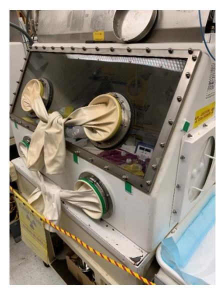
FIGURE 3: STANDARD GLOVE BOX

LBNL officials stated that they actively monitor radiological conditions on external surfaces of gloveboxes but not within them. Specifically, RPG officials stated that radiological workers take radiation readings at the sleeve openings of the glovebox and 30 cm from the sleeve openings, but the workers do not survey inside the sleeves or take readings within the glovebox.