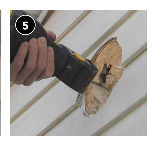
Locate exterior vent based on duct run and size hole less than 1/2 inch larger than duct.