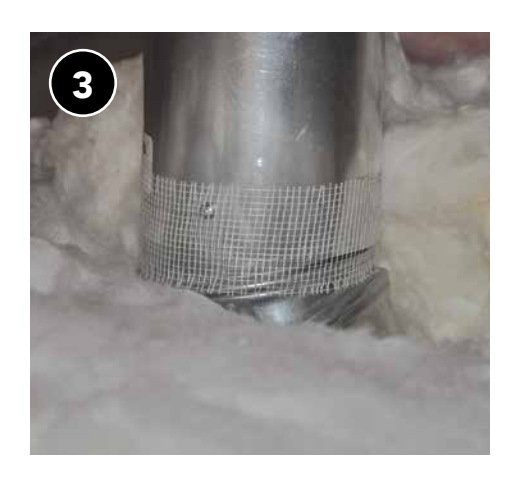
Wrap seams with mesh.