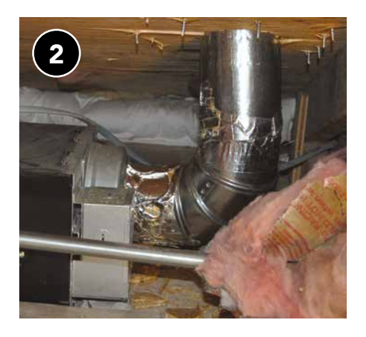
Keep duct run as short as possible with few turns, and run to exterior, either via roof or sidewall.