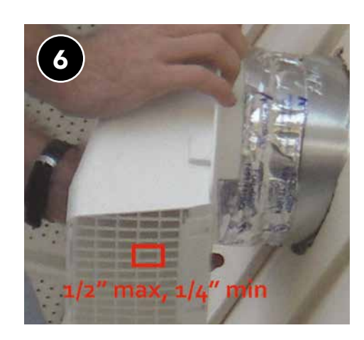
Chose appropriate exterior termination to match size of duct while minimizing water and pest intrusion. Seal around exterior termination as needed.