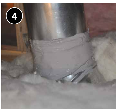
Cover mesh with a layer of mastic to seal all joints. Alternatively, the seams can be sealed with UL-listed foil tape.