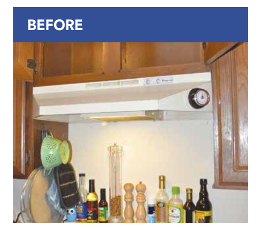
Kitchens and bathrooms must be ventilated to control moisture, vapor, and combustion gases.

Aligns With Standard Work Specifications 6.0101.1, 6.0101.2, 6.0201.1, 6.0201.2