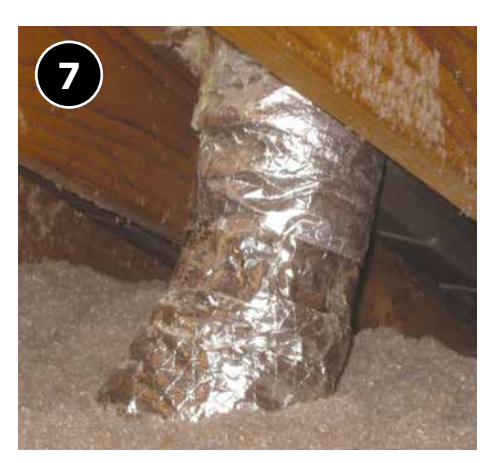
Insulate ducting that runs through unconditioned space to R-8.