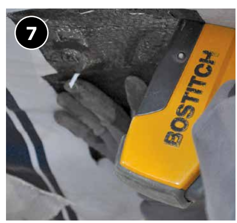
Stitch staple patch to ensure permanent adhesion.