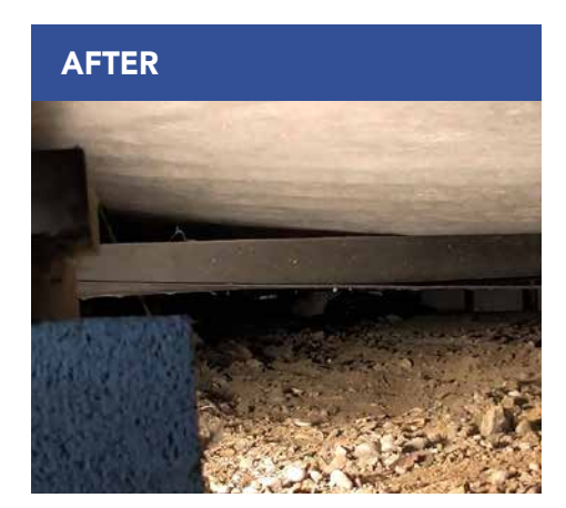
Manufactured home bellies that are insulated with complete coverage with durable repairs improve the overall efficiency of the floor assembly.