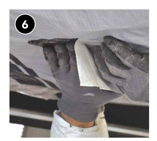
Apply waterproof, permanent adhesive to patch for belly wrap, with patch sized at least 3 inches larger than hole in barrier.