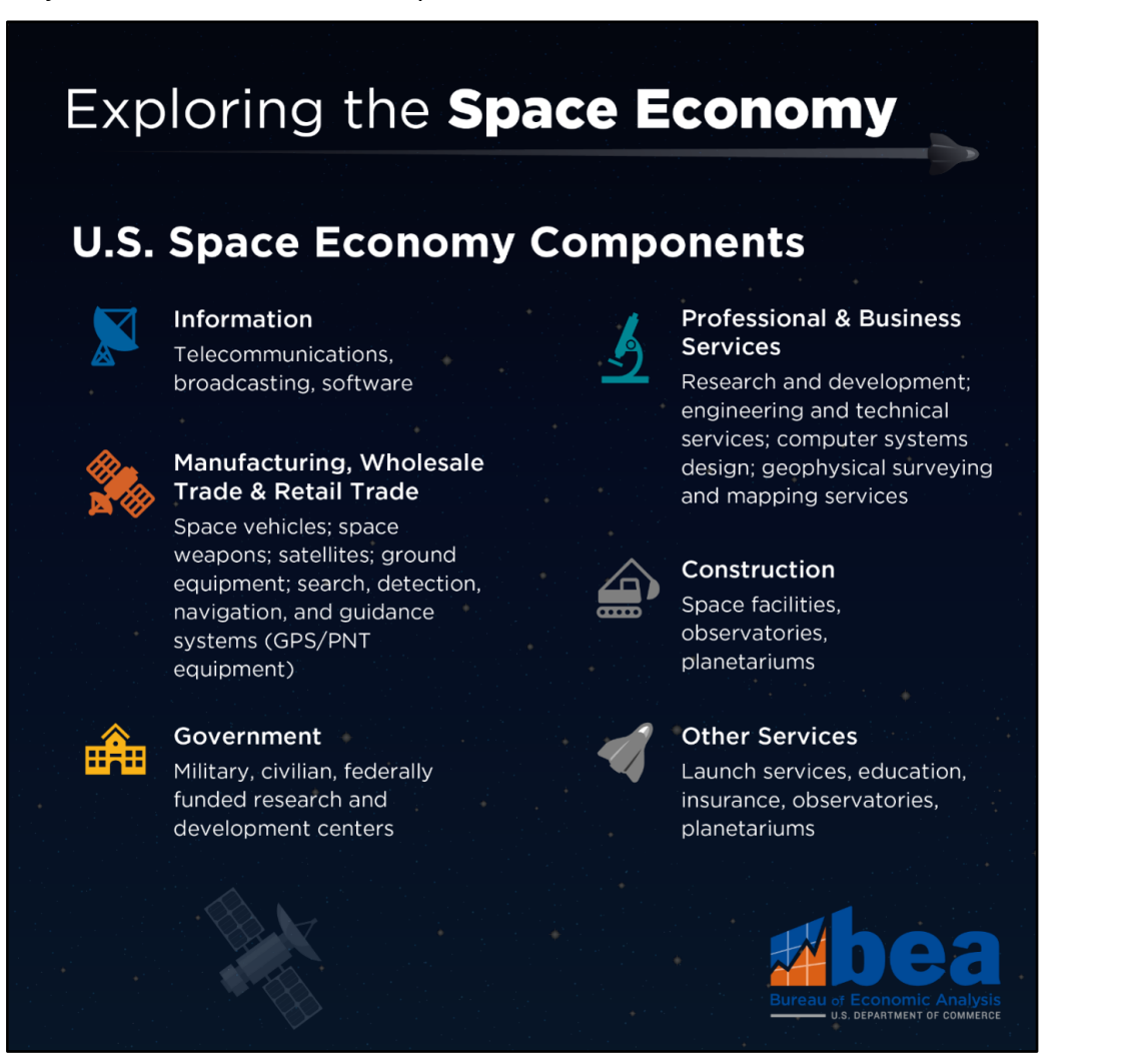
Figure 2. United States Space Economy Components as articulated by the Bureau of Economic Analysis Space Economy Report<sup>8</sup>

a gross output of $195 billion in 2019.<sup>67</sup> Though astronauts may be the most well-known space workers, this vast space workforce includes thousands of scientists, engineers, and technicians who are equally essential. They contribute a variety of skills and expertise to research, design, build, implement, and evaluate technology and systems that are critical to U.S. space activities. In addition, there are space workers employed in occupations that include a broad range of disciplines, degree-levels, work-related credentials, and skills that may not be typically represented as "space STEM" careers. Our Nation's future work in space is reliant on the ability to build a diverse, skilled STEM workforce that is trained and equipped to advance efforts to enable innovation, exploration, and discovery. The appendix includes a snapshot of some skilled technical occupations for which a high school diploma or equivalent, associate degree, or postsecondary nondegree award are the typical credentials of new entrants. Future work will include ongoing engagement with the space ecosystem and an in-depth analysis of the current and future space workforce needs.