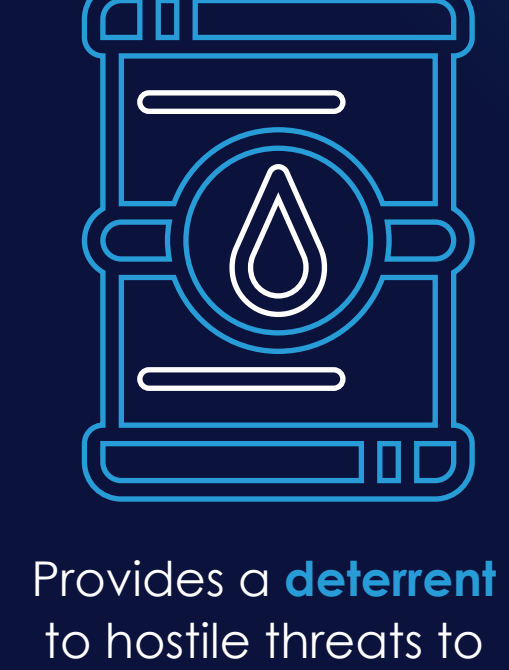
cut off oil supplies