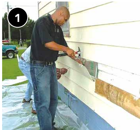
Protect work area from debris and dirt before removing siding.