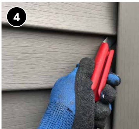
Remove siding as needed based on the type of exterior cladding material. Many siding types (e.g., vinyl, aluminum, steel) can be loosened with a siding tool.