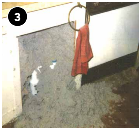
Confirm the wall integrity can withstand the air pressure of blown insulation and make sure all holes are repaired to prevent insulation blowouts.