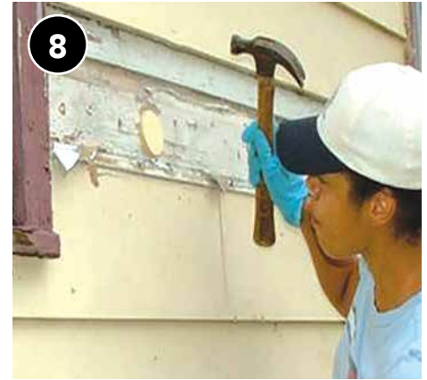
Plug and seal insulation access holes. When present, repair the drainage plane to prevent water intrusion.