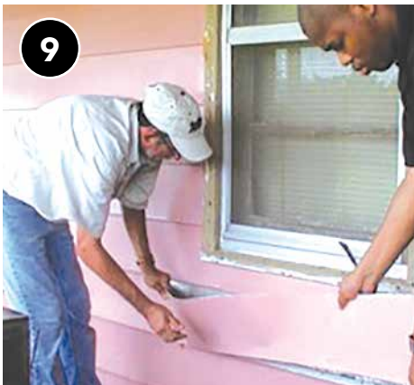
Carefully reinstall any removed siding.