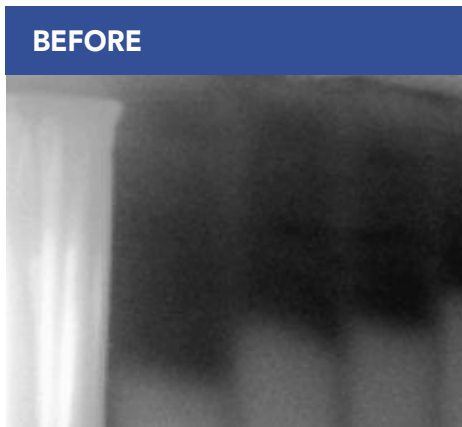
Walls that are missing insulation or underinsulated present opportunities for energy savings. (The darker shaded wall cavities of this thermal image are uninsulated.)

Aligns With Standard Work Specifications 4.0202.1