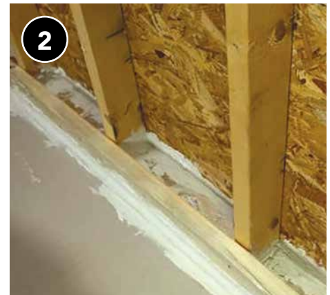
Ensure balloon-framed walls are blocked at top and bottom to prevent insulation from unintentionally blowing into the attic or basement.