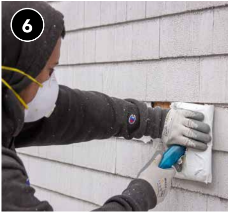
Using an injection fill tube, insulate all cavities to the proper density.