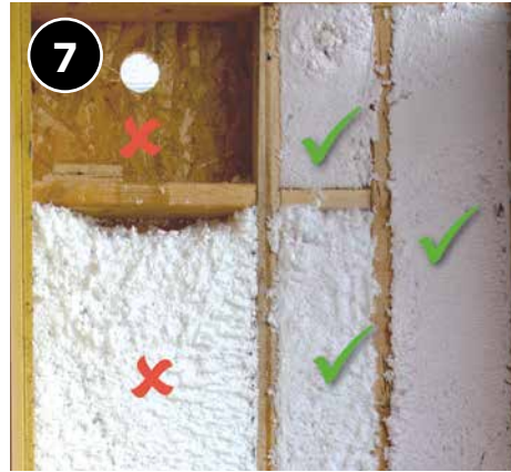
Ensure all cavities are filled before completing the job.