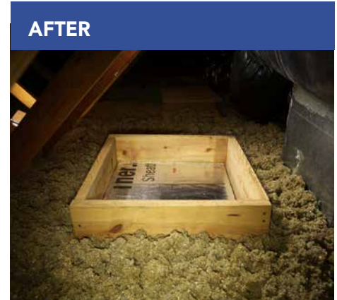
Safely and durably sealing and insulating attic access doors prevents air movement and reduces heating and cooling loads.