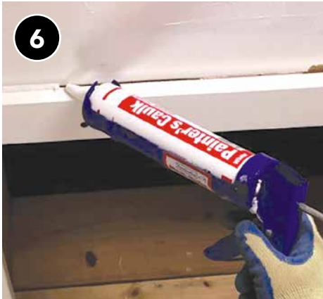
Trim is air sealed with appropriate material.