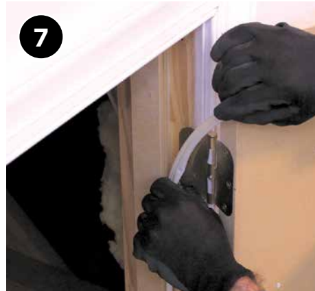
For vertical accesses, run weatherstripping or closed cell foam tape to air seal at these doorways too. Hold vertical accesses closed with latch if necessary.