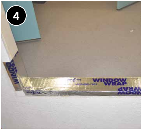
Replace flashing as needed.