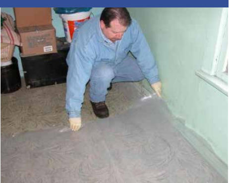
Prepare the work area for installation by moving any customer belongings and protecting the floor. See job aids 1-1 and 1-2 for more details on working lead-safe on homes built prior to 1978.