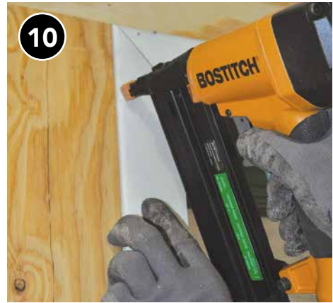
Reinstall existing trim or replace as needed.