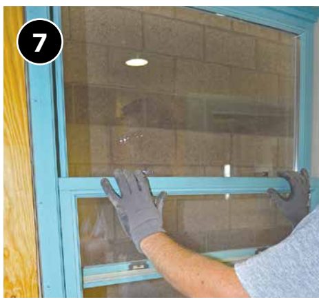
Ensure window is operational.