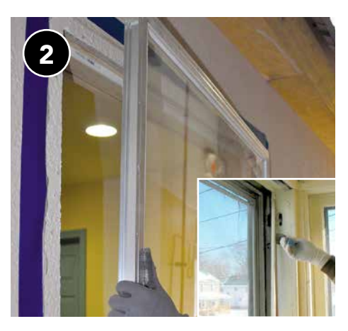
Carefully remove window trim/stops prior to removing the existing window.