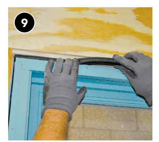
Insulate and seal rough opening with backer rod and/or low expansion spray foam.