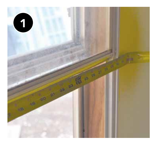
Measure window rough opening to confirm the replacement window is the correct size and will fit.