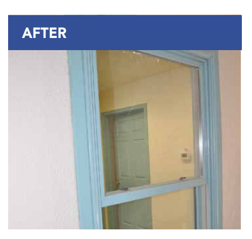
Window opens and closes properly; all exterior edges are air-and watertight.