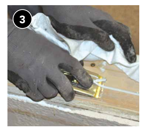
Clean up jamb and repair any damage. Insulate sash weight cavities with low expanding spray foam if present.