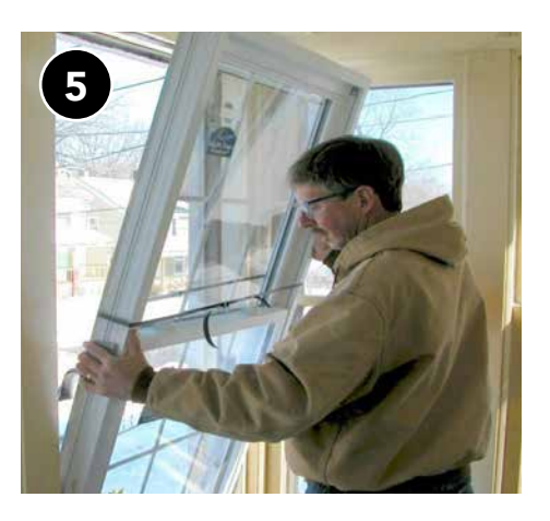
Dry fit window.