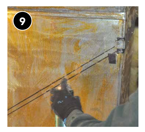
Spray adhesive over area where piece will be installed.