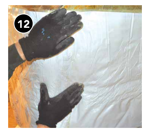
Ensure overlapping flap is securely attached to the lower layer to maintain a complete vapor barrier, or tape seams with UL-181 tape.