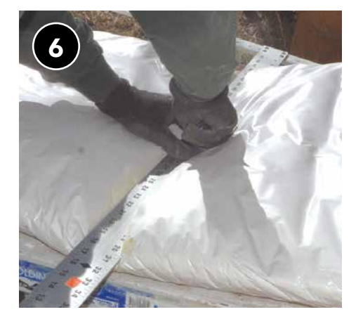
Cut to size for area to be covered. Insulate all exposed metal of the plenum.