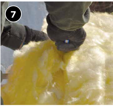
To ensure a complete vapor retarder, trim insulation from vapor barrier to create overlap flap for seams or tape seams with UL-181 tape.