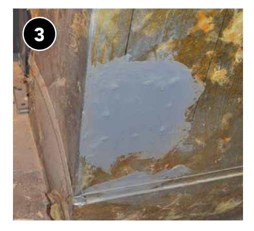
Patch holes in ducts and plenum with appropriate materials (see 19-1 Seal Ducts With Mastic).