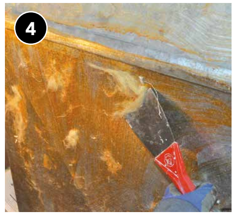
Prepare plenum by removing any residue from old insulation.