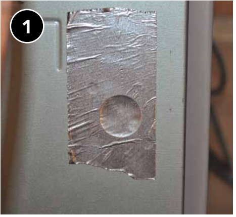
Cover any unnecessary holes in the air handler cabinet.