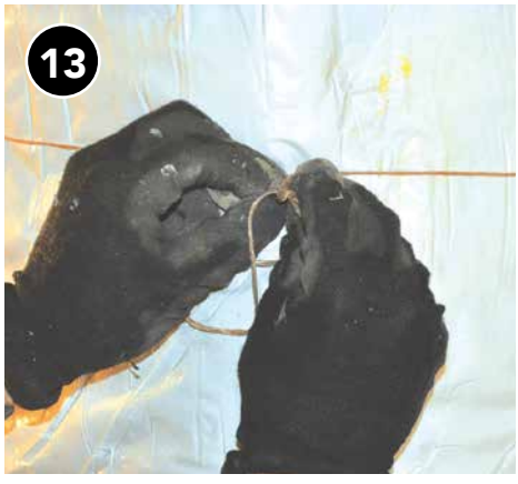
Support insulation to prevent movement over time, securing in place without puncturing vapor retarder.