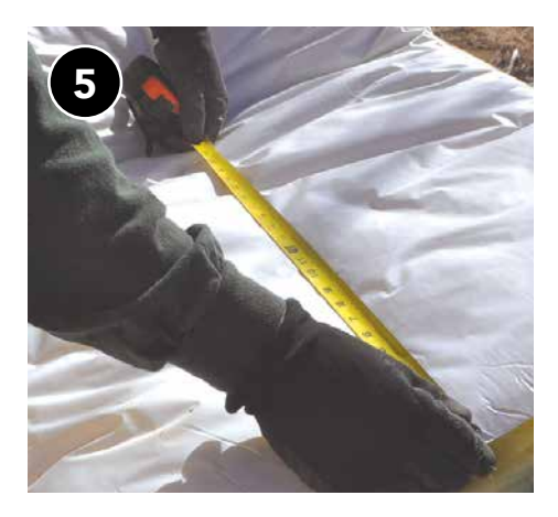
Measure insulation to take maximum advantage of large sheets of duct insulation.