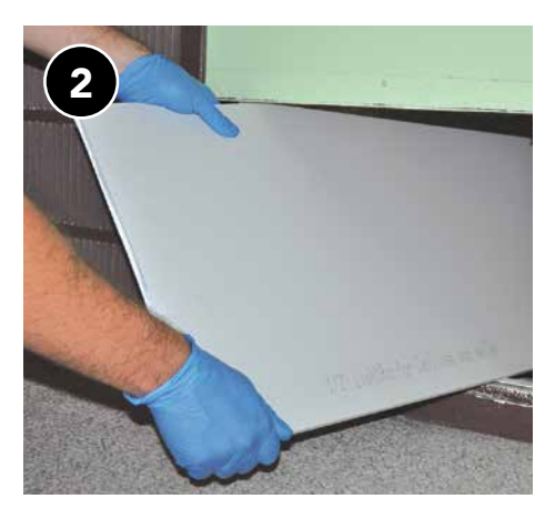
Check return cavities inside building envelope to ensure they are sealed off from unconditioned spaces.