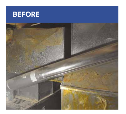
Uninsulated supply and return plenums located in unconditioned spaces allow for energy loss and contribute to occupant comfort issues.