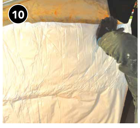
Ensure smooth and unrippled adhesion of insulation to metal of plenum.