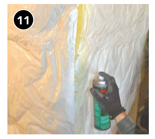
Spray adhesive along vapor retarder at seam to seal closed.