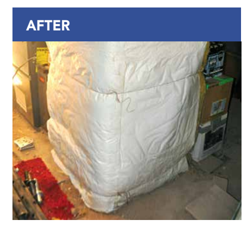
Ducts are connected, supported, and air-sealed properly.