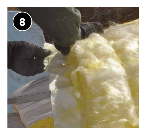
Ensure clean surface for adhesion at overlap seam.