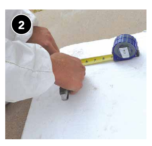
Cut blocking material to fit.