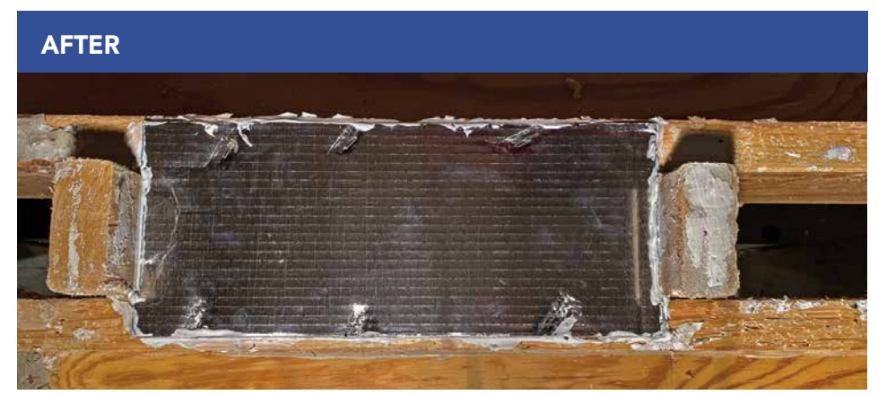
Securely sealing off these cavities prevents air movement, as well as providing a barrier to hold in insulation and providing fire blocking.