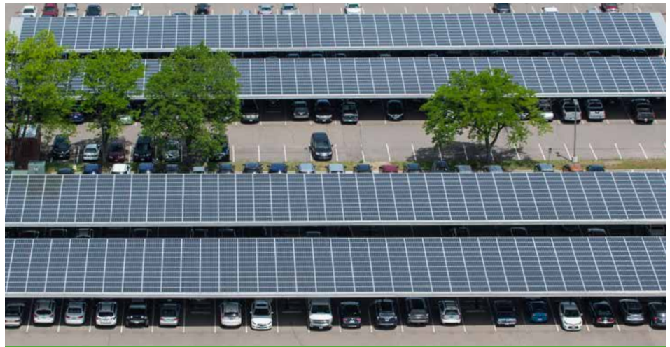
Figure 1. A solar carport may be implemented under an ESPC ESA.