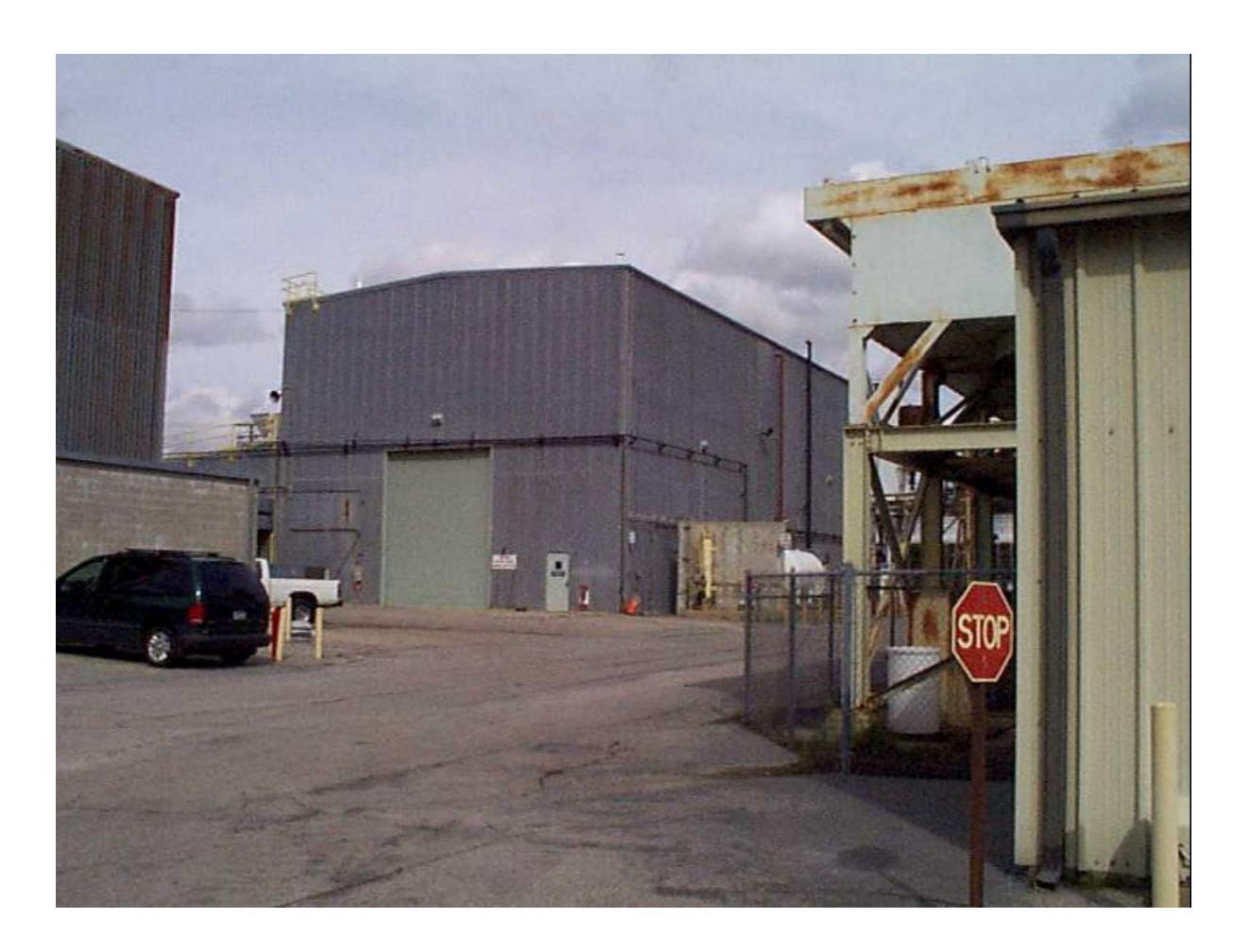
Photograph – Building 4013