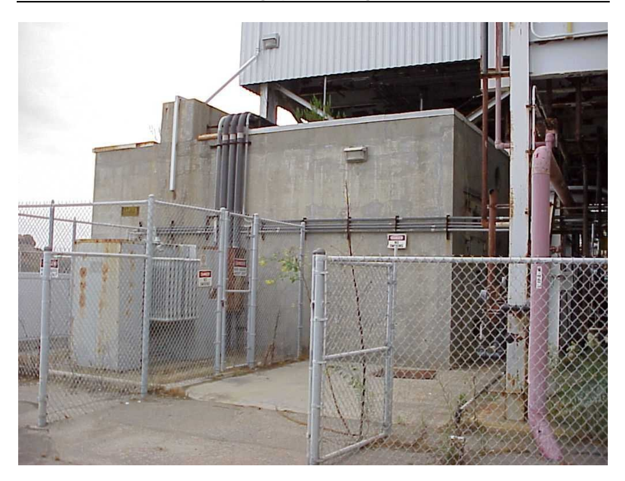
Photograph – Building 4012