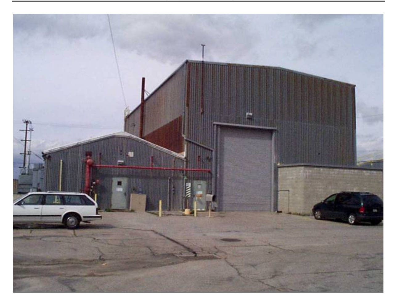
Photograph – Building 4019