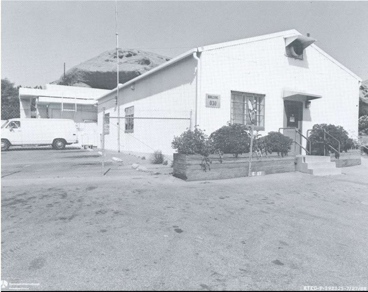
Photograph – Building 4030