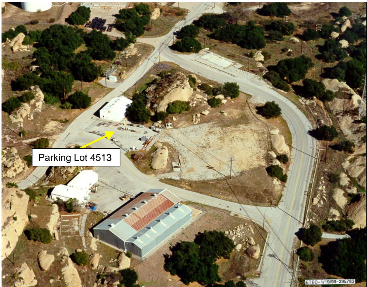
Photograph – Parking Lot 4513