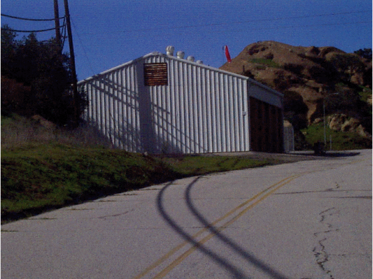
Photograph – Building 4014