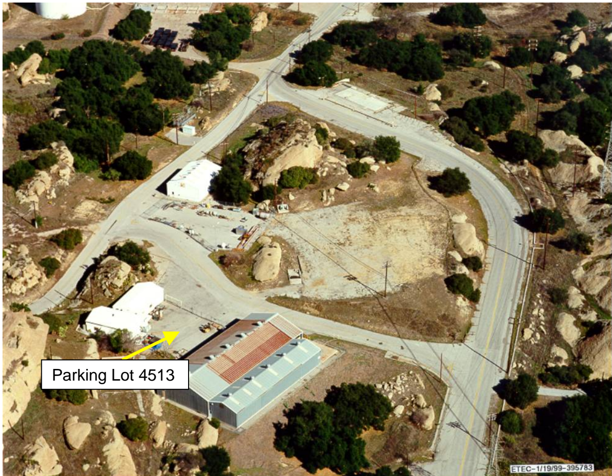
Photograph – Parking Lot 4535