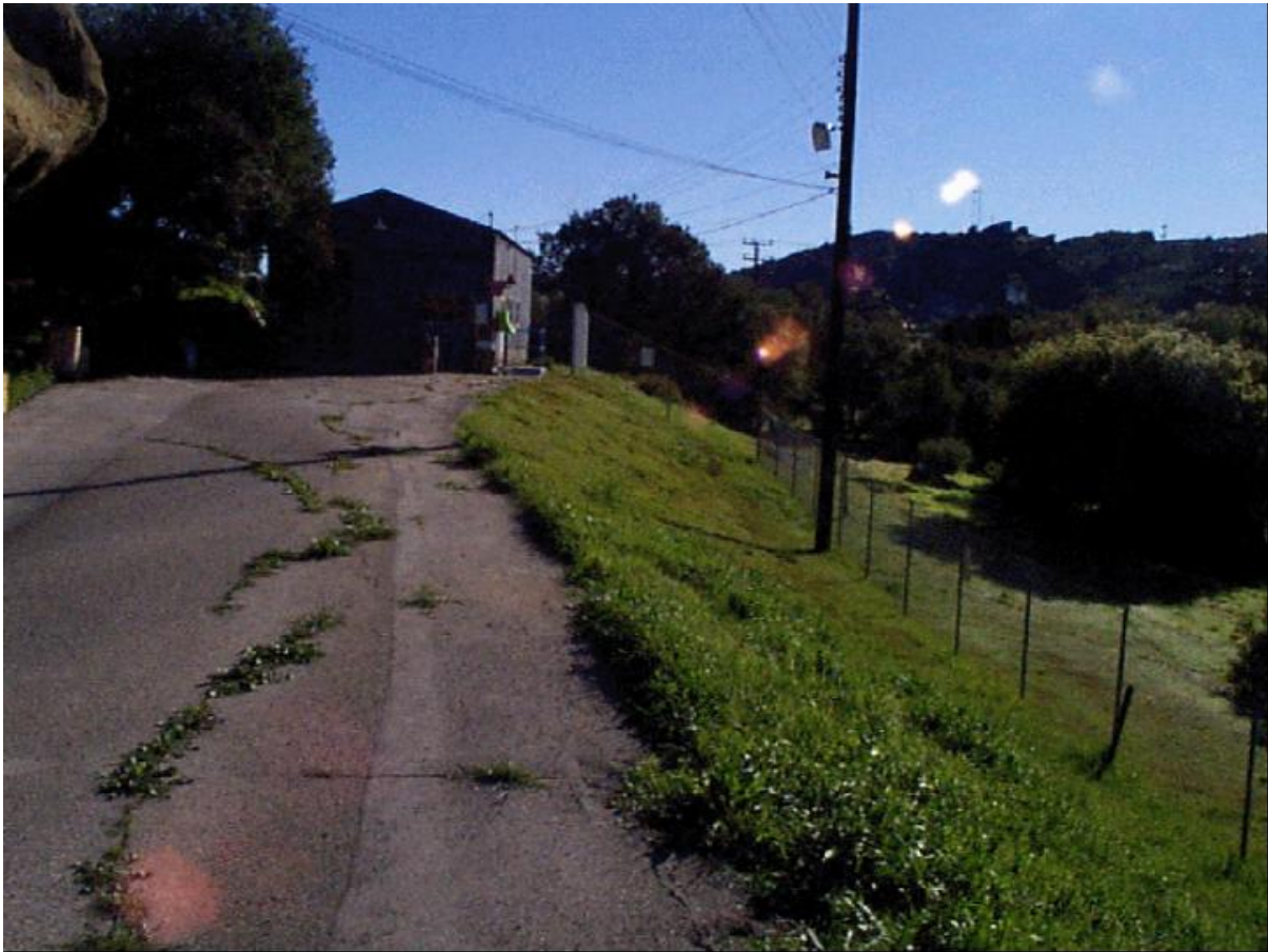
Photograph – Building 4029