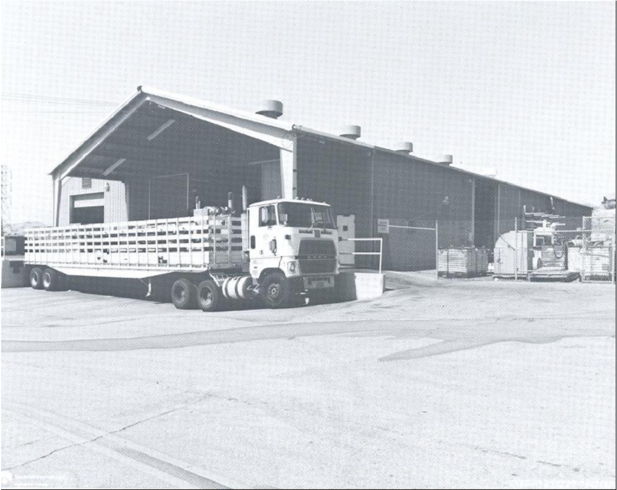
Photograph – Building 4641