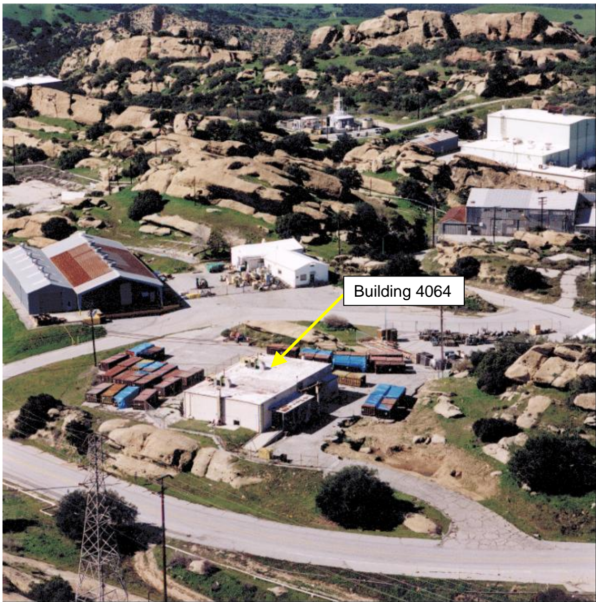
Photograph 1 – Building 4064