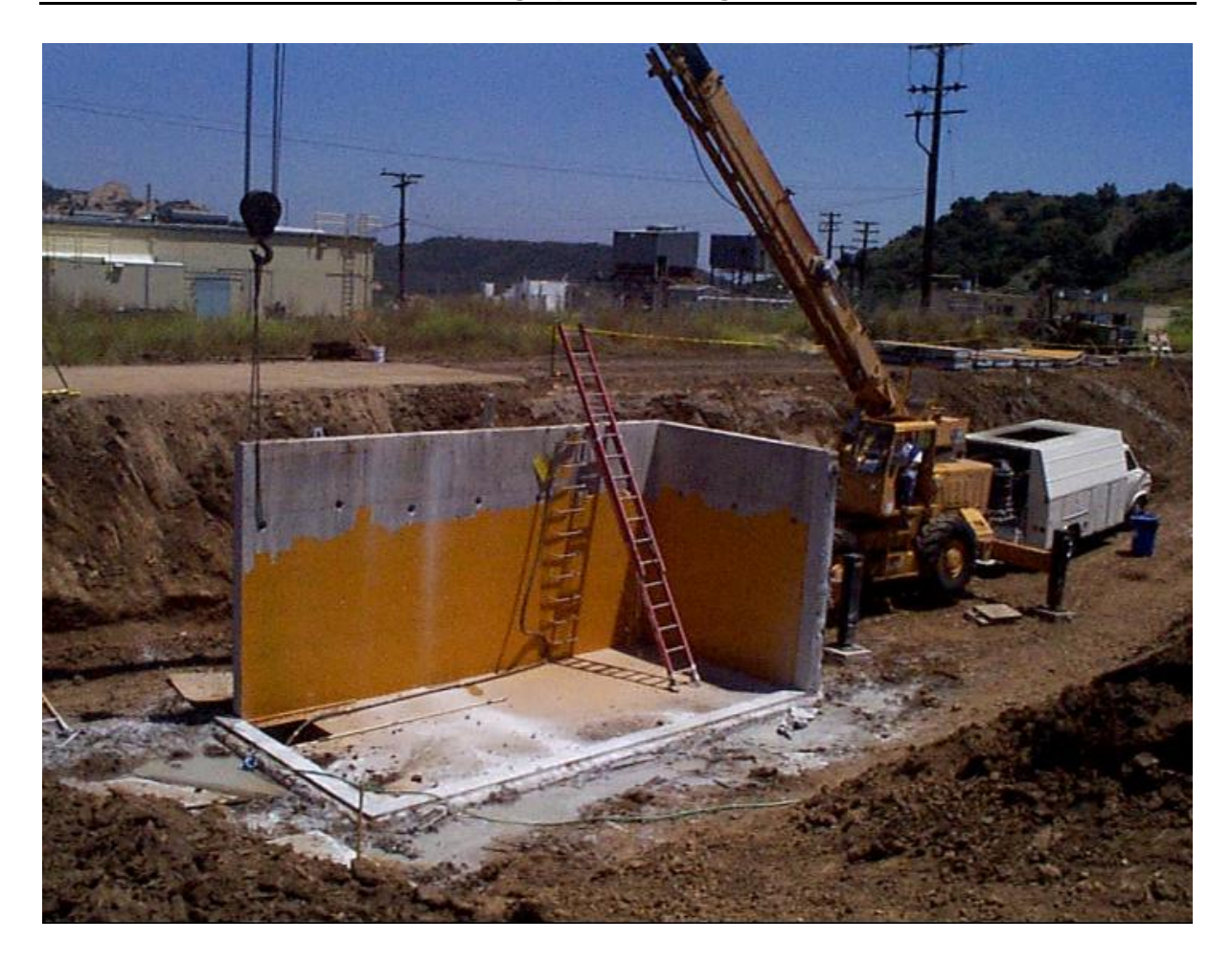
Photograph – Building 4468