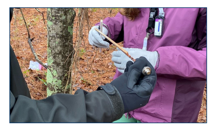
A core sample is extracted from a tree at the Savannah River Site (SRS). Tree ring samples were analyzed for total tritium content and tritium chemical speciation.

Tritium is a radioactive isotope of hydrogen that is typically present at low levels in the environment, but it can be released during nuclear industrial processes. If the level of environmental tritium exceeds background concentrations, this may be an indication of nuclear activities nearby. The chemical behavior of tritium is practically identical to ordinary hydrogen, so tritium can be found as water, replacing an H in H2O, or in any number of organic compounds found in living organisms. Recently, research from Savannah River National Laboratory (SRNL) was featured on the August 2022 cover of the Royal Society of Chemistry journal "Environmental Science – Processes & Impacts" for their work measuring low levels of tritium in pine and oak tree cores around the Savannah River Site (SRS).<sup>1</sup>