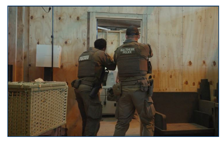
Members of the Baltimore Police SWAT Team enter the mock irradiator room to interrupt adversaries.

the exercise throughout the day across multiple divisions, units, and shifts. The end state is to exercise the maximum number of officers with minimal operational impact, as opposed to exercising limited resources in a day-long event.