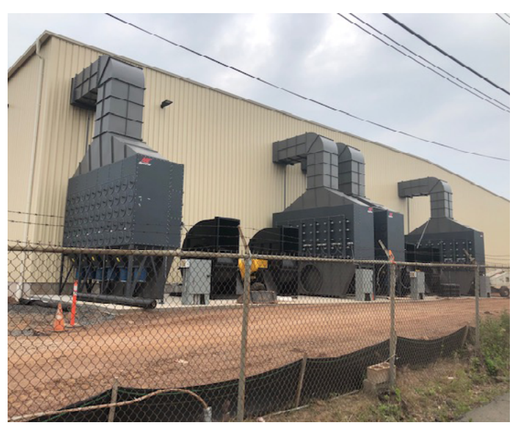
Construction of the new waste transfer station, New Brunswick, New Jersey, Site, June 2019.

The property owner will inspect the site and submit a remedial action protection certification to NJDEP every two years, as specified in the no-further-action decision. LM is responsible for managing site records and responding to stakeholder inquiries.