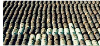
Over 700,000 tons of depleted uranium produced as a by-product of enriching uranium to weapons grade

EM's first priority is to ensure the safety and health of the public and EM's workforce while continuing to protect the environment.