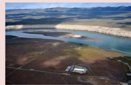
Millions of cubic meters of soil and billions of gallons of groundwater contaminated by environmental releases of radioactive and hazardous materials

Over 1,000 metric tons of weapons-grade uranium