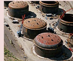
Over 90 million gallons of liquid waste produced as a by-product of the separation of plutonium and uranium from used nuclear fuel rods