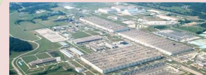
Over 5,000 facilities contaminated as a result of activities such as reactor operations and uranium enrichment (which produce fissile material for nuclear weapons)