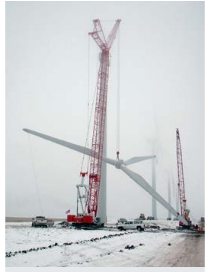
Small and large wind generation projects can benefit from the U.S. Department of Agriculture's Rural Energy for America Program Renewable Energy Systems & Energy Efficiency Improvement Loans & Grants.

rd.usda.gov/programs-services/energy-programs/ruralenergy-america-program-renewable-energy-systems-energyefficiency-improvement-guaranteed-loans