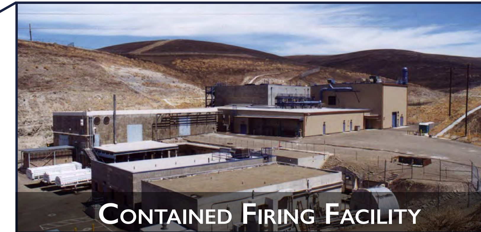
CONTAINED FIRING FACILITY