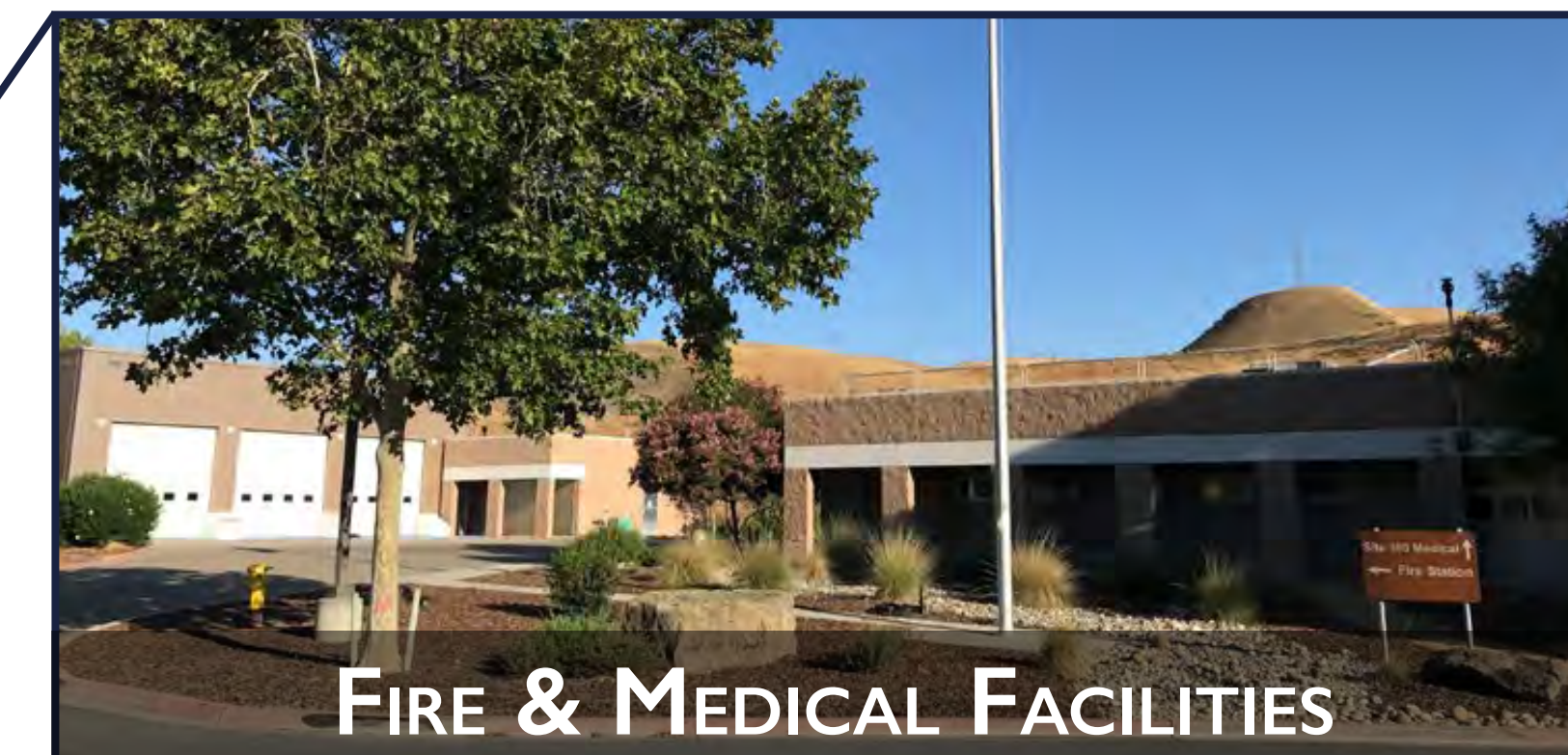
FIRE & MEDICAL FACILITIES