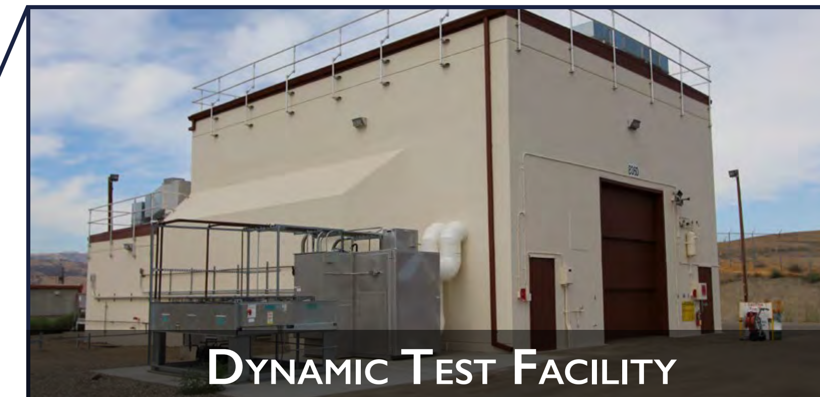
DYNAMIC TEST FACILITY