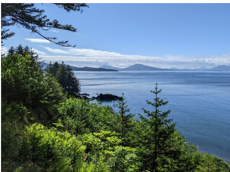
A view from Spruce Island.

The U.S. Department of Energy (DOE) Energy Transitions Initiative Partnership Project (ETIPP) works with remote and island communities seeking to transform their energy systems and increase energy resilience. Through ETIPP, DOE national laboratories partner with regional organizations to provide technical assistance to address selected communities' energy needs.