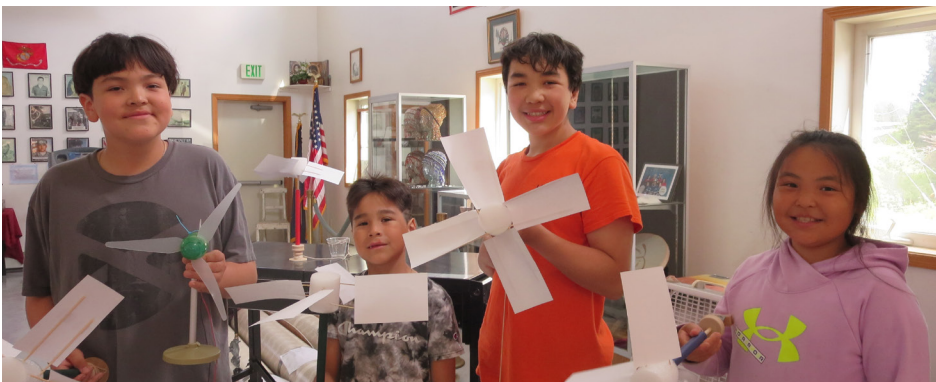
Ouzinkie kids learn about wind energy by creating paper turbines.

Ouzinkie is one of many communities using ETIPP to make energy more resilient and affordable. To learn how you can join ETIPP, visit the About ETIPP page. https://www.energy.gov/eere/about-energy-transitions-initiative-partnership-project ■