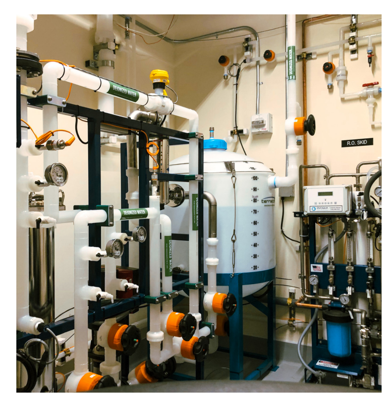
Private client. Healthcare DI Skid