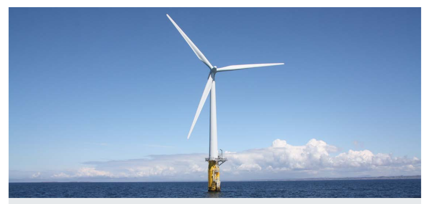
DOE's Advanced Research Projects Agency-Energy (ARPA-E) Aerodynamic Turbines Lighter and Afloat with Nautical Technologies and Integrated Servo-control program funded a variety projects to enable the next generation of efficient and cost-optimized floating turbine designs.