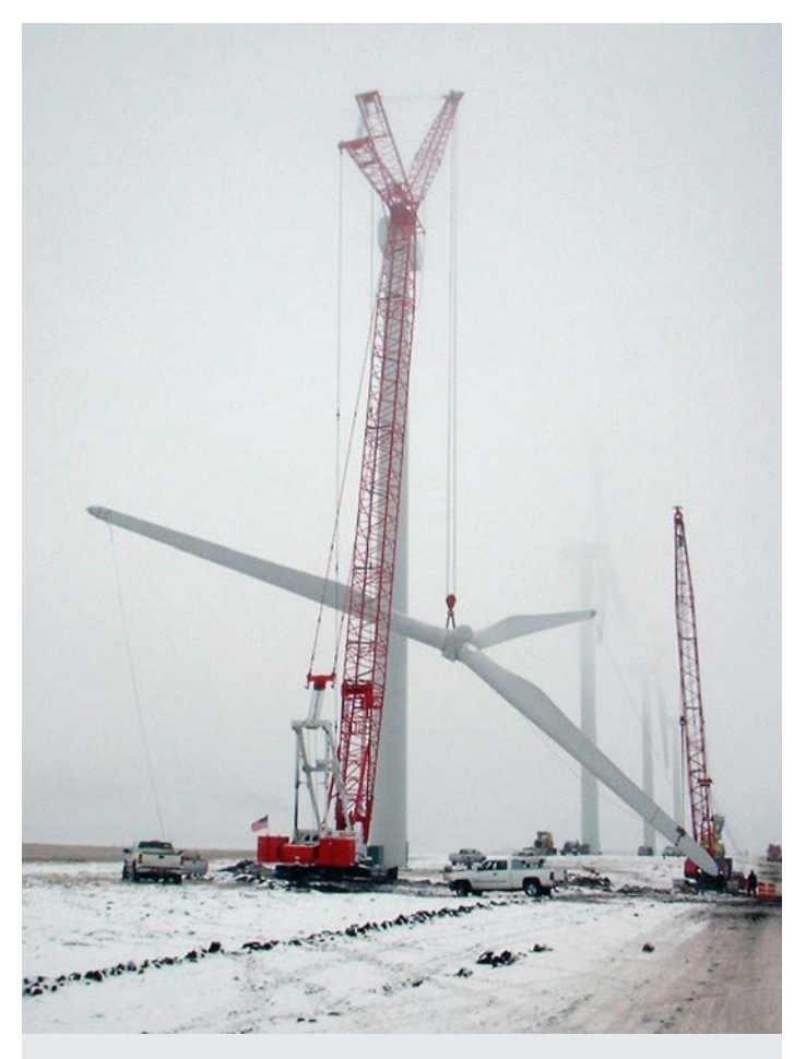
Small and large wind generation projects can benefit from the U.S. Department of Agriculture's Rural Energy for America Program Renewable Energy Systems & Energy Efficiency Improvement Loans & Grants. Photo from NREL , 11919

and rural small business owners. Since 2009, REAP has supported more than 340 wind energy projects nationwide.