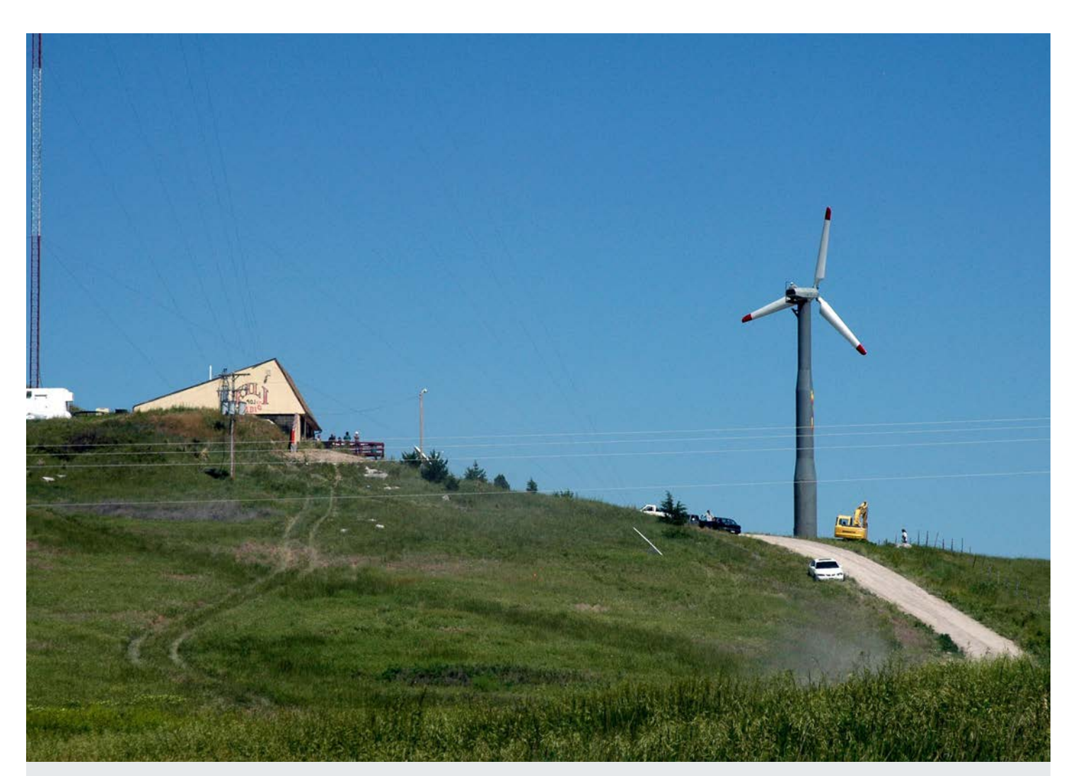
The Lakota Nation installed a 65-kW Nordtank turbine that annually supplies 120 MWh of power to KILI, the Pine Ridge Reservation radio station known as the voice of the Lakota Nation in South Dakota.

energy.gov/eere/wipo/state-energy-program-competitive-financial-assistance-program