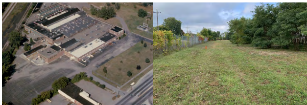
Colonie National Lead Industries plant, 1983.

FUSRAP personnel reviewed the radiological conditions at more than 600 sites that were potentially involved in early atomic weapons and energy activities, and they identified 46 sites that met the requirements to be included in FUSRAP. A descendent of the AEC, DOE began cleanup projects in 1979 and completed 25 sites. In 1997 Congress assigned responsibility for cleanup of remaining sites – and any subsequently added sites – to USACE. After USACE cleans up a site, DOE takes over the site's long-term stewardship and maintenance.